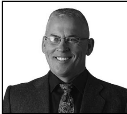
Pictured above: Commissioner Joe Dabulskis