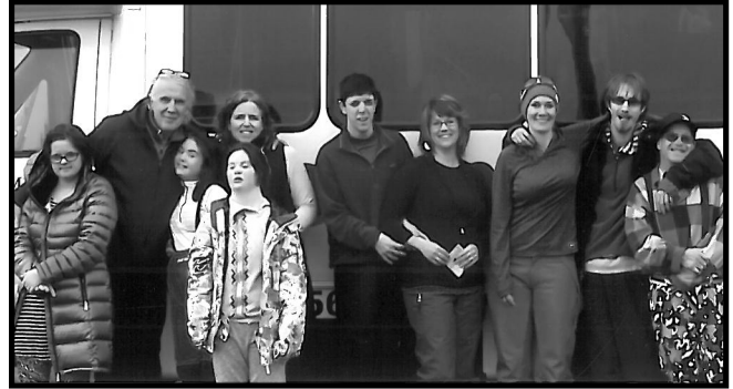
2016 coaches and athletes at Mt. Hood Meadows pictured in order from left to right:

Sherman County contracts with the Medicaid