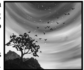
Pictured: The painting for the May 6 Paint Nite.

Go to https://paintnite.com/events/1063687.html to purchase your tickets! Tickets are $45 each. A portion of each ticket purchased will support Little Wheats, Inc. Daycare. You may also contact Little Wheats directly at 541-565-3152 or email at littlewheats@centurylink.net if you have questions.