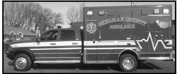
Pictured: The newly purchased 2016 Horton Ambulance.

Sherman County Ambulance recently took ownership of a 2016 Horton Ambulance. The chassis is a Dodge Ram Laramie 5500 with a crew cab, which is a fairly new concept. The cab protects the crew, keeping them in safety restraints while the ambulance is in motion without a patient. The crew cab added 2 ½ feet to the length and shortened the patient compartment by 1 foot.