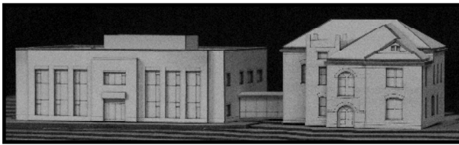
Pictured: A conceptual model of the new building attached by link to the existing courthouse. Note: The model is a draft in progress.

During May, an important milestone was met with the completion of the schematic design phase of the new Sherman County administration building. This process included representatives from all affected County departments as well as the County Court and the Circuit Court. Hennebery Eddy Architects facilitated their involvement and identified features and requirements that would be needed in order to provide efficient services to the county now and in the future. The result was several design options which were narrowed and refined through the work of the steering committee and with additional input from department representatives. Finally, the preferred option was developed into a schematic design, which includes a rough floor plan, site plan, and information on the intended systems and building materials. Over the coming months, this design will be developed and refined into a complete set of documents that can be used to construct the building. At completion of schematic design, the project is on