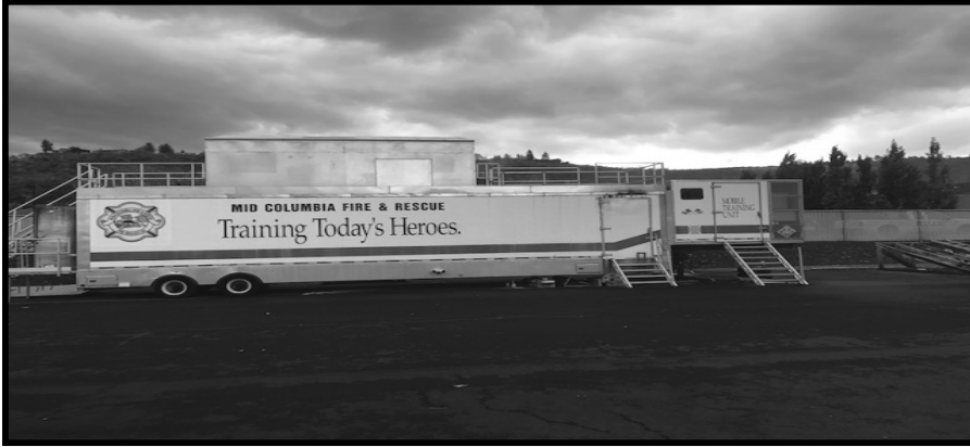
Pictured: South Sherman Fire & Rescue display the newly acquired Burn Trailer