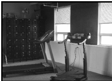
Pictured above is the various fitness equipment available for use at the new Wasco Fitness Center.

auditorium. The room would be the perfect venue for your family reunion, company dinner, bridal or baby shower, wedding, birthday party . . . and much more.