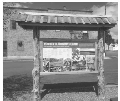
Tourism Kiosk located in Wasco, Oregon