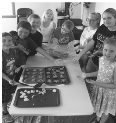
Healthalicious Cooking camp July 2017