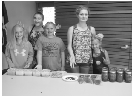
Kids Food Preservation workshop June 2017