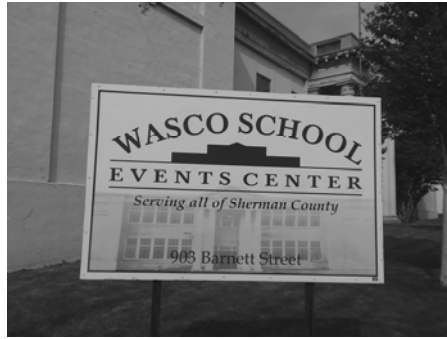
Wasco School Events Center Sign