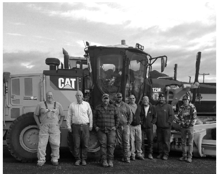
Road Department—Sherman County Fair Grand Marshal