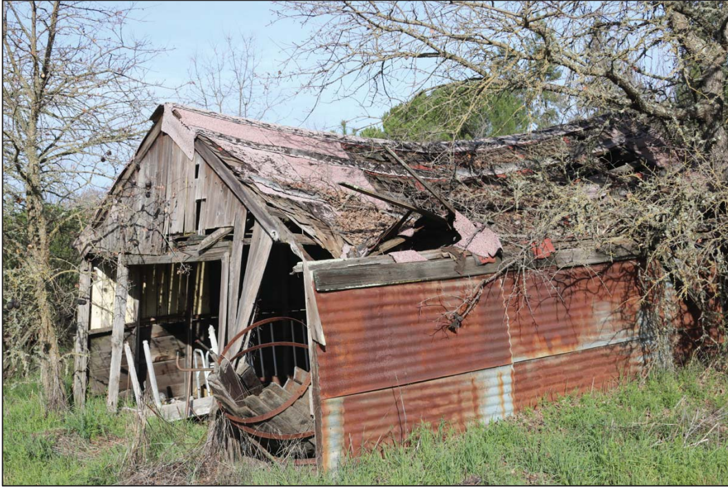
Figure 67: South elevation, southeast corner