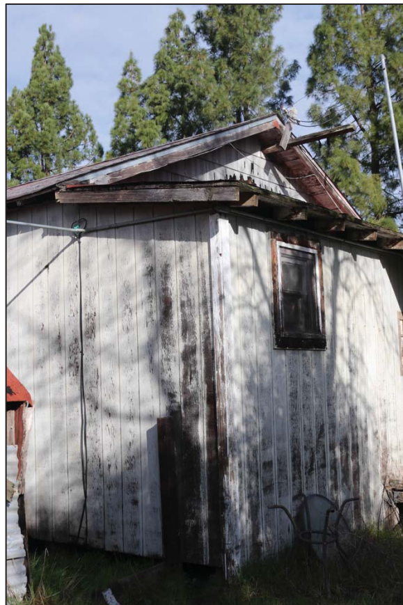
Figure 42: Southeast corner, shed addition