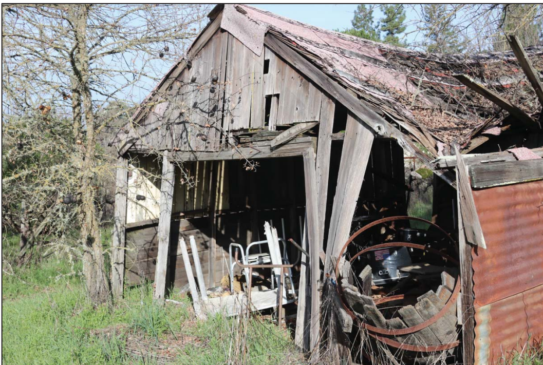
Figure 66: South elevation