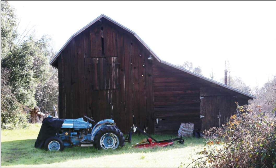
Figure 77: West elevation, gambrel section and shed roof wing