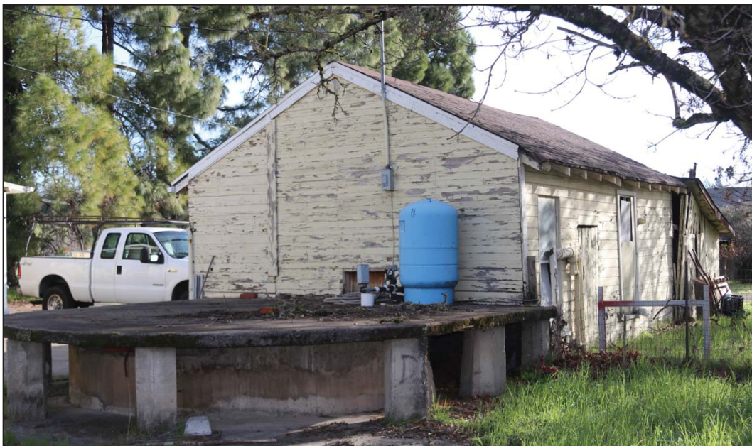
Figure 50: West and south elevations, well cover