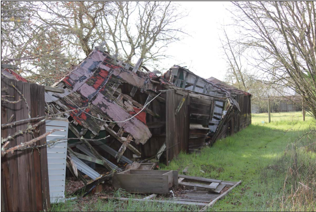
Figure 65: West elevation, south end (collapsed)