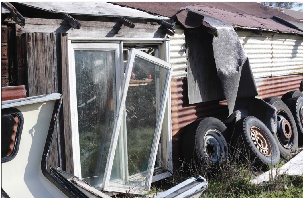
Figure 76: South elevation