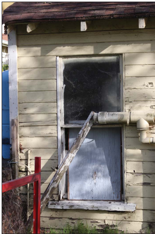
Figure 52: South elevation, window