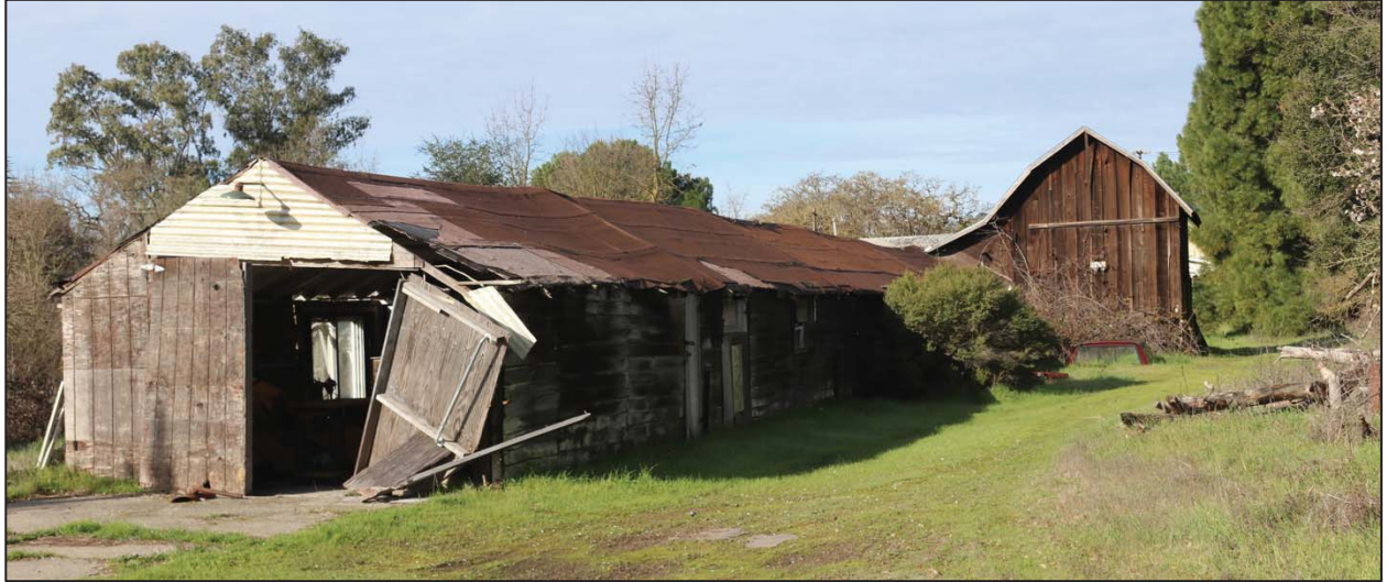
Figure 71: East and north elevations, looking west