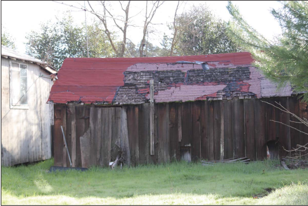
Figure 61: West elevation, north end