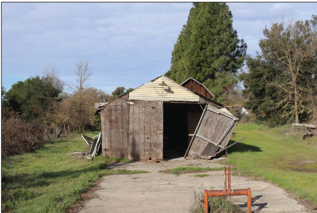
Figure 74: East elevation