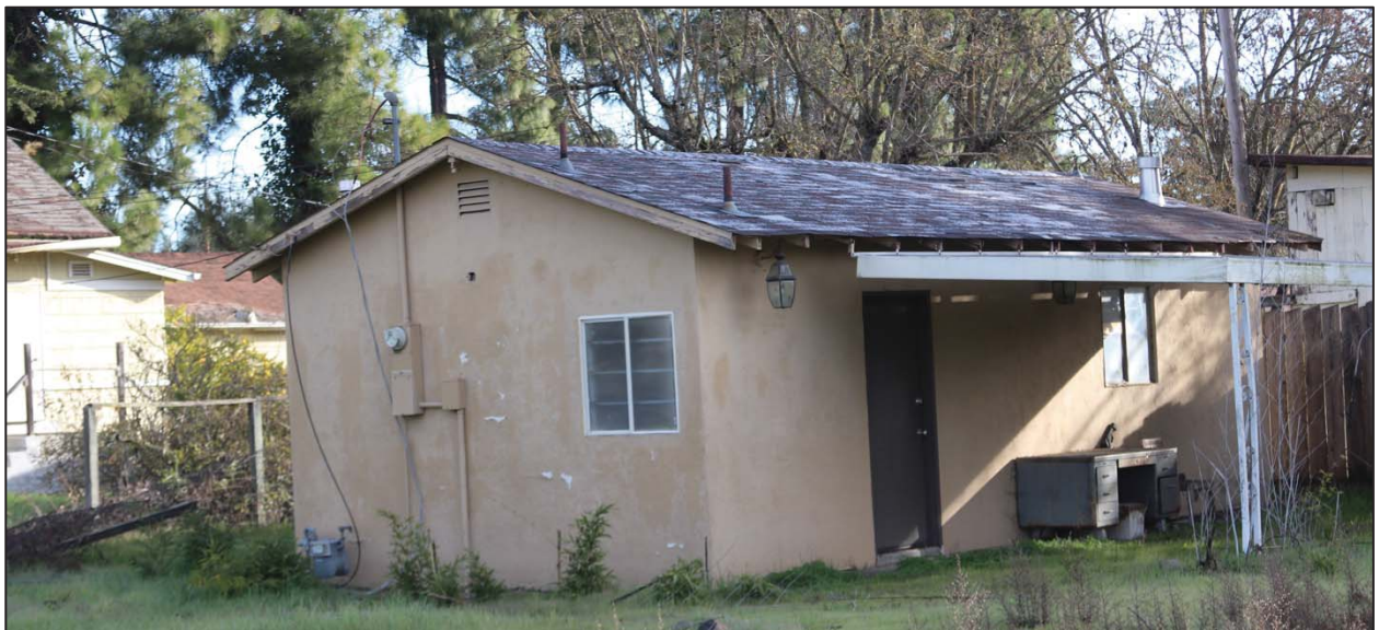
Figure 56: West and south elevation, southwest corner