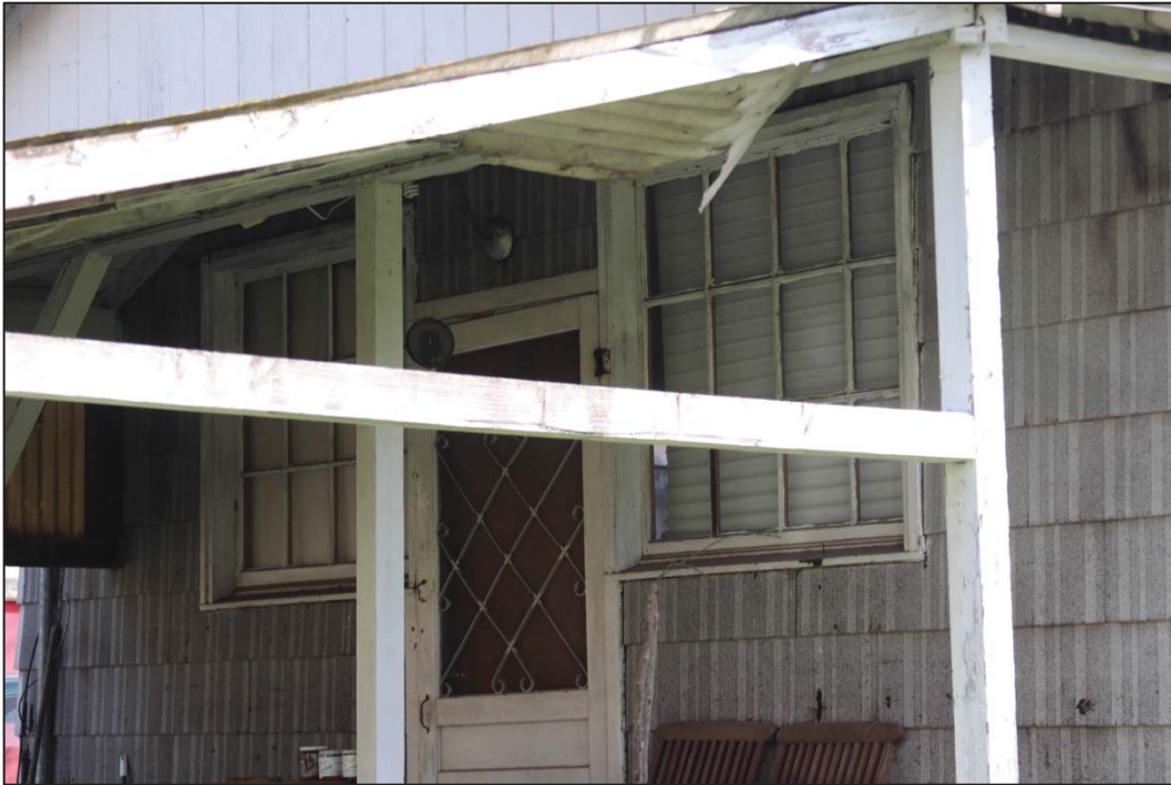
Figure 39: West, picture windows under porch