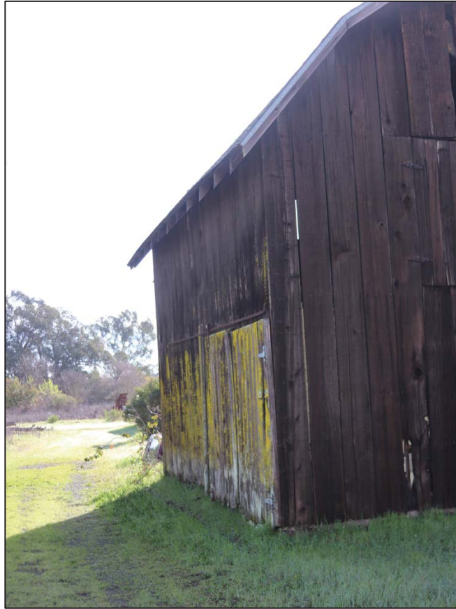
Figure 83: North elevation, looking east