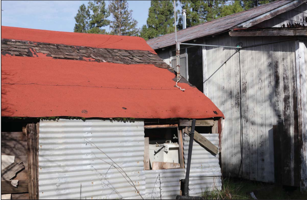
Figure 41: South elevation, southeast corner