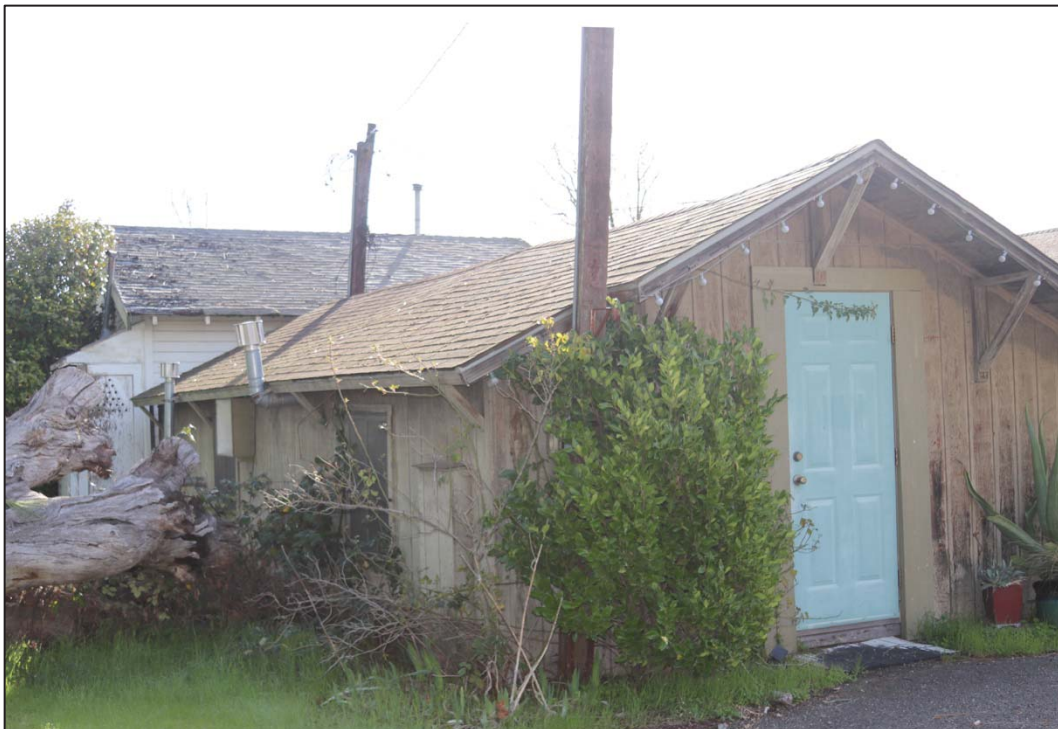
Figure 36: West and north elevations, front wing