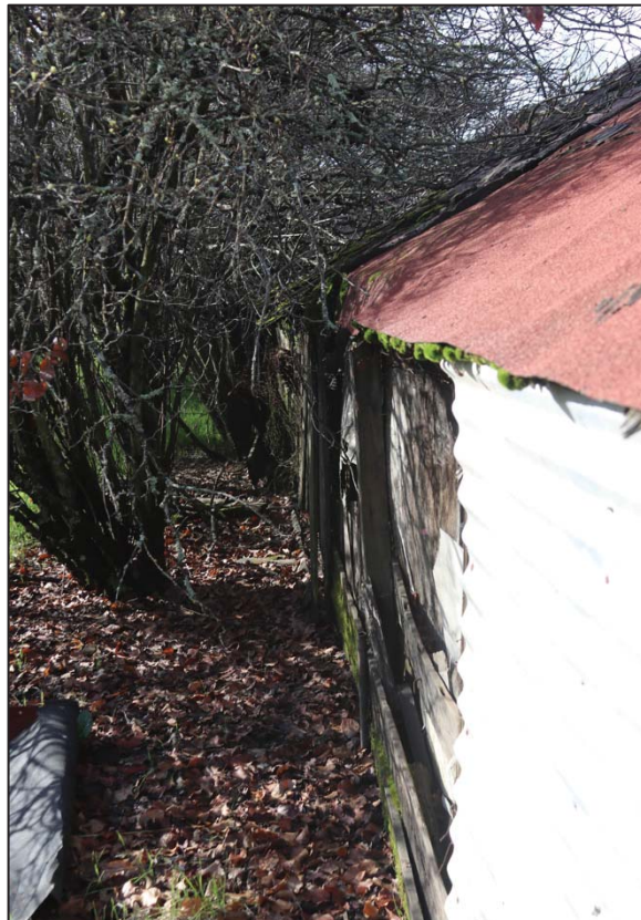
Figure 68: East elevation, looking south