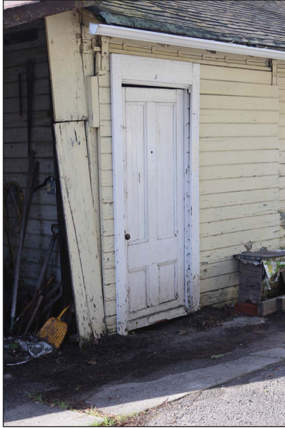
Figure 55: North elevation, recycled door