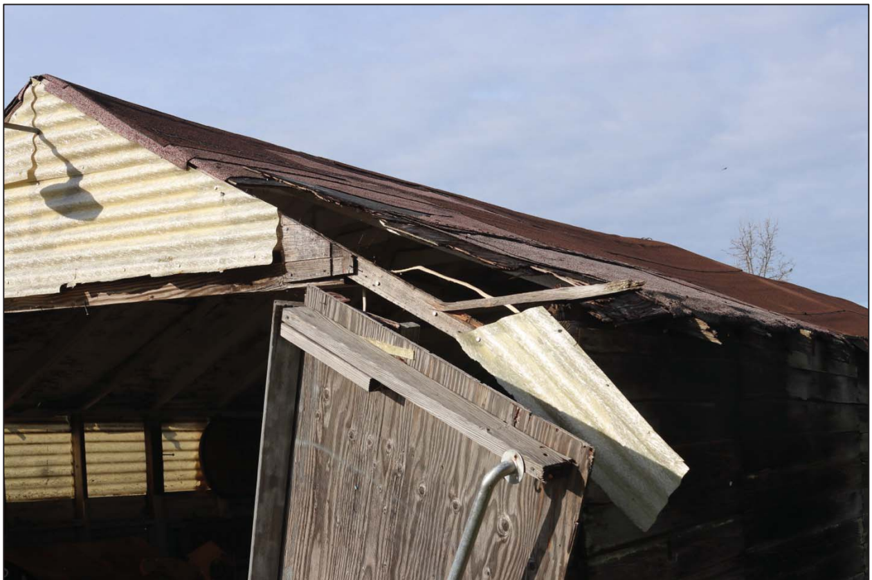
Figure 72: Roof at northeast corner