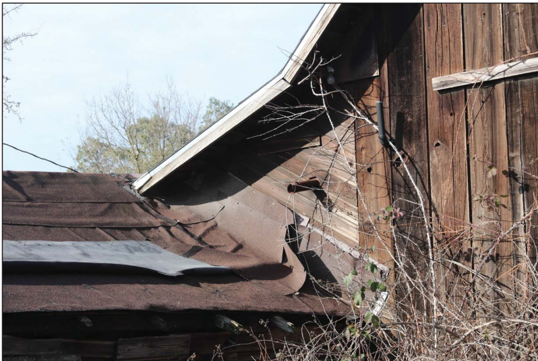
Figure 82: East elevation, junction barn and poultry shed