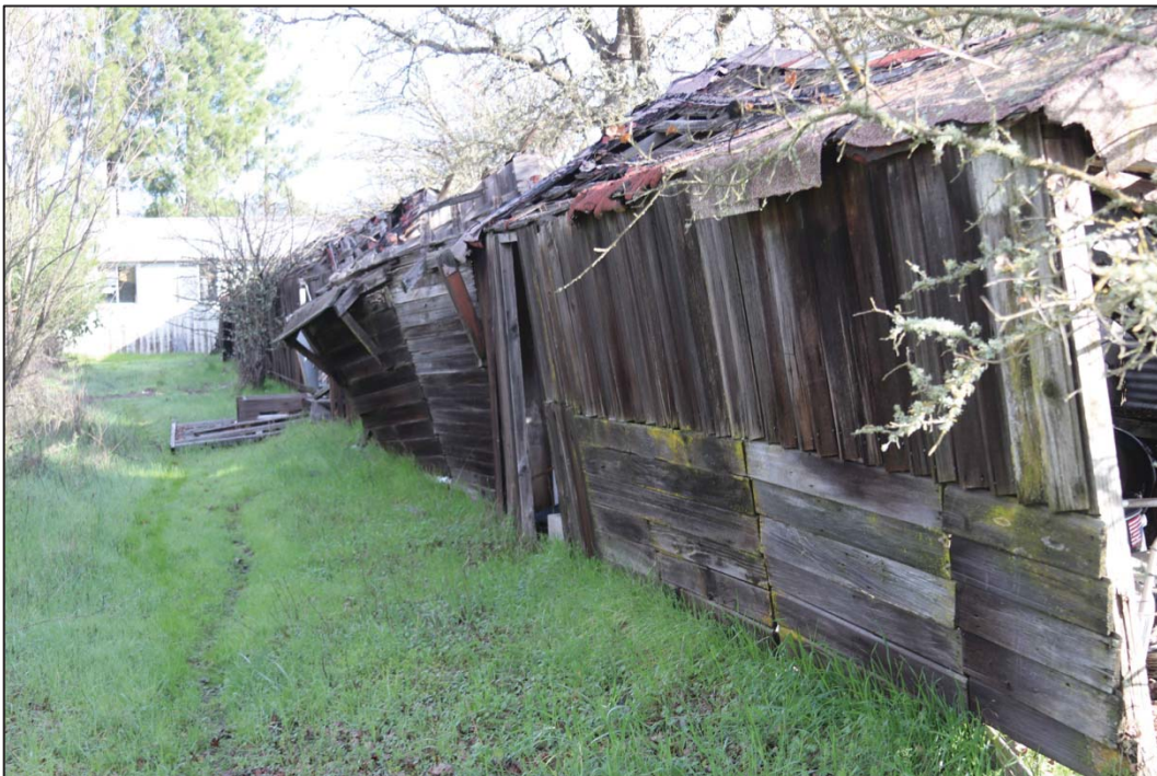
Figure 62: West elevation, looking north