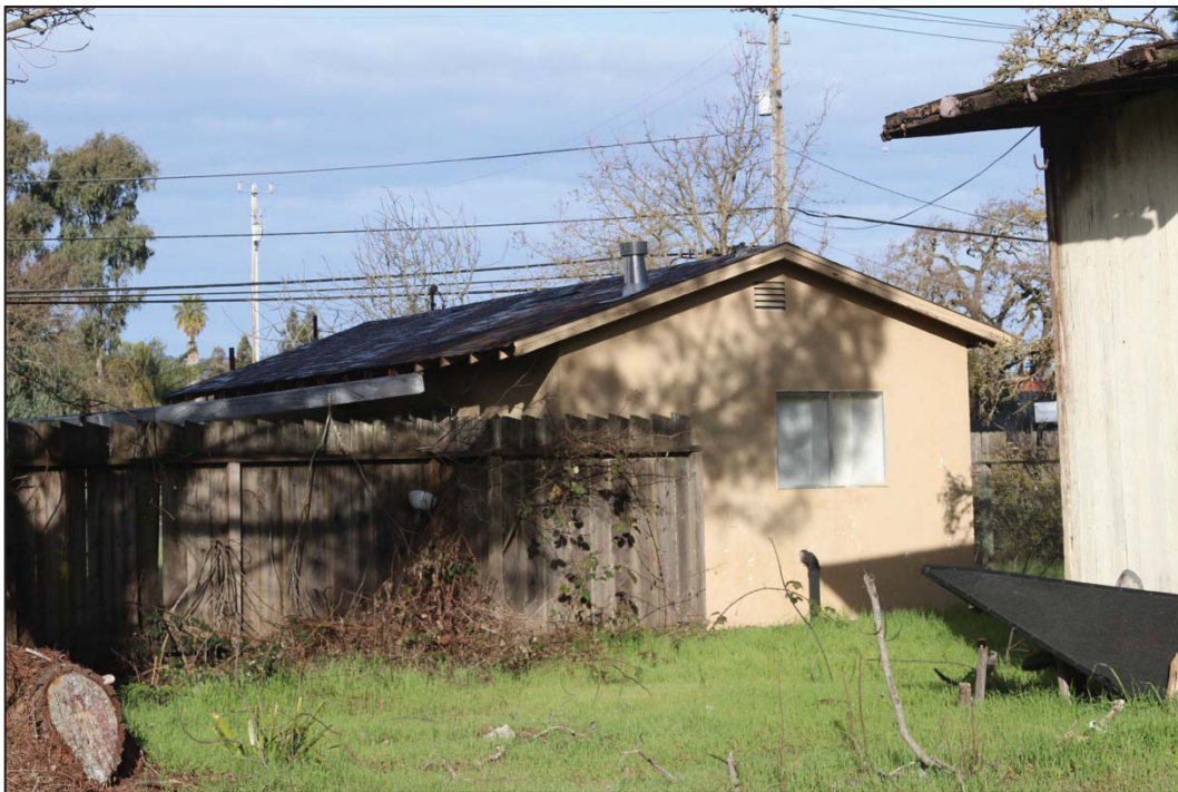
Figure 60: East and south elevations, southeast corner