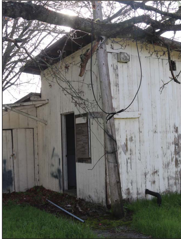
Figure 45: West and north, northwest corner