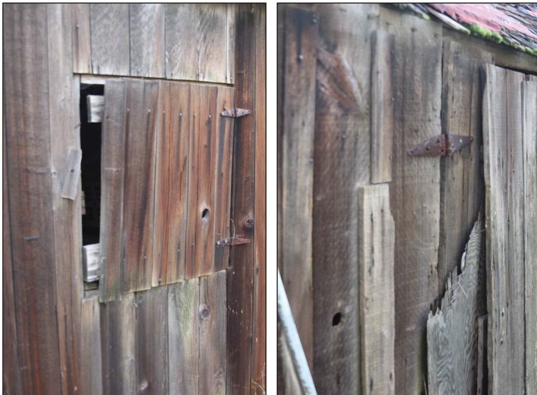
Figure 64: West elevation, window and hinge details