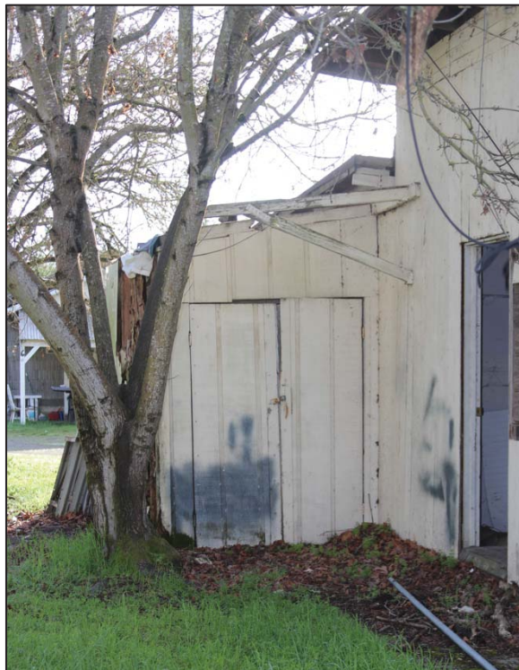
Figure 46: North wing, west elevation, doors