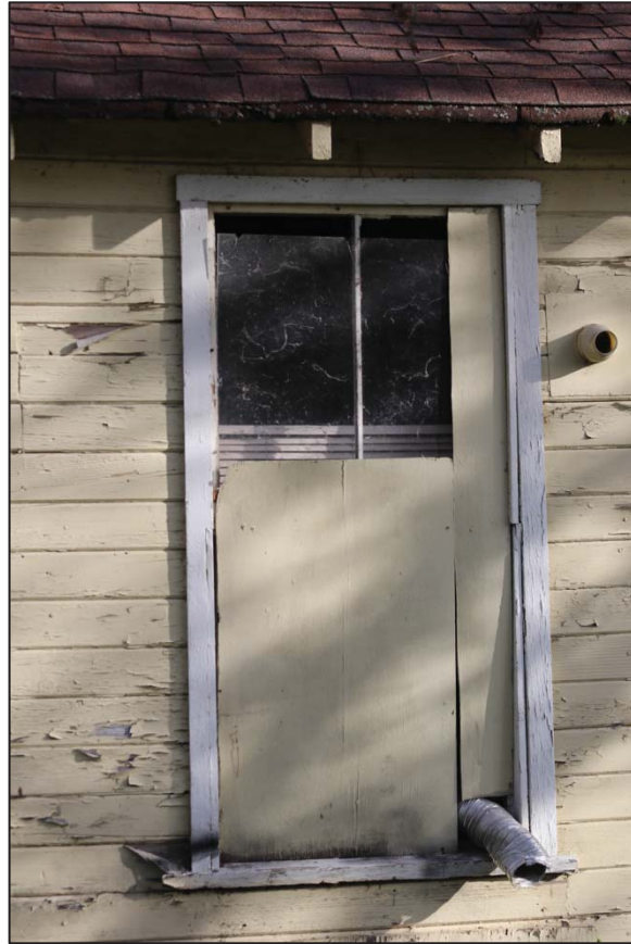
Figure 53: South elevation, window