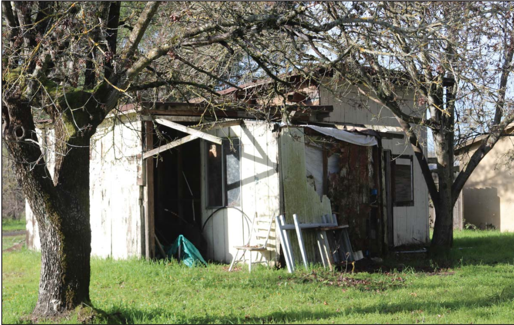
Figure 47: North elevation, wing