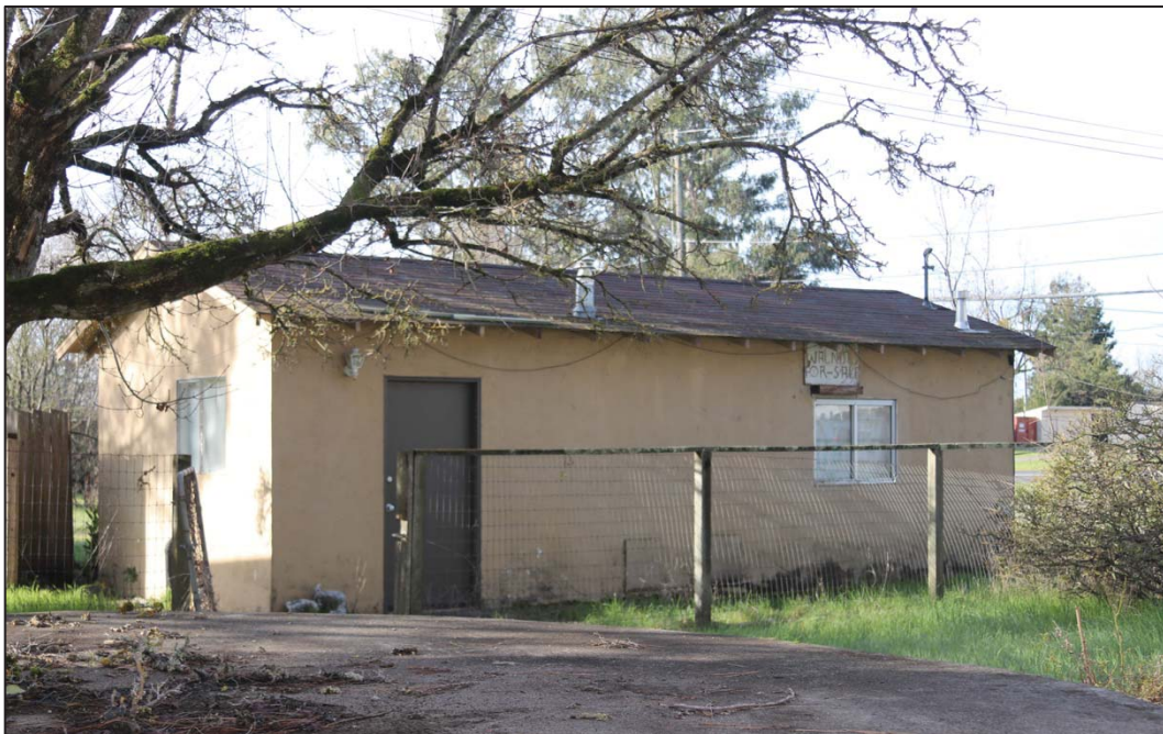
Figure 58: North and east elevations, northeast corner