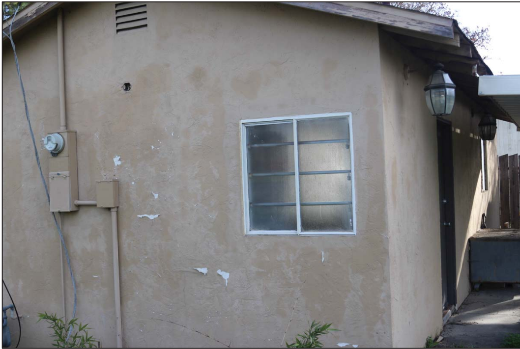
Figure 57: West elevation, window