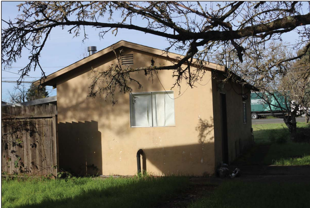
Figure 59: East elevation