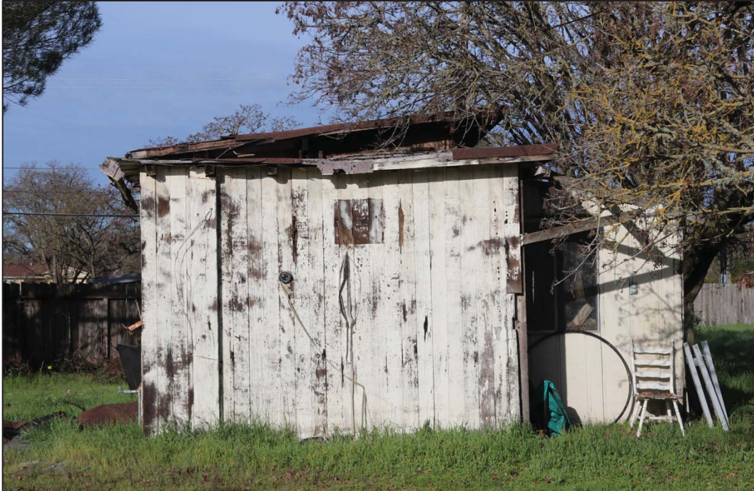
Figure 48: East elevation