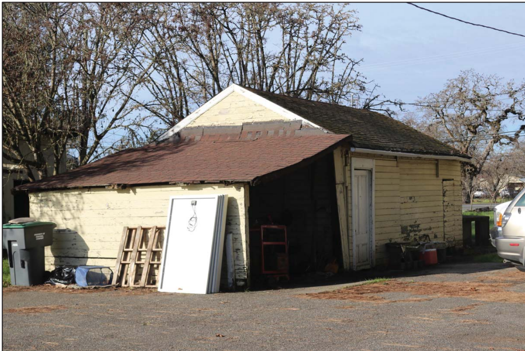
Figure 54: East and north elevations, shed on east, northeast corner