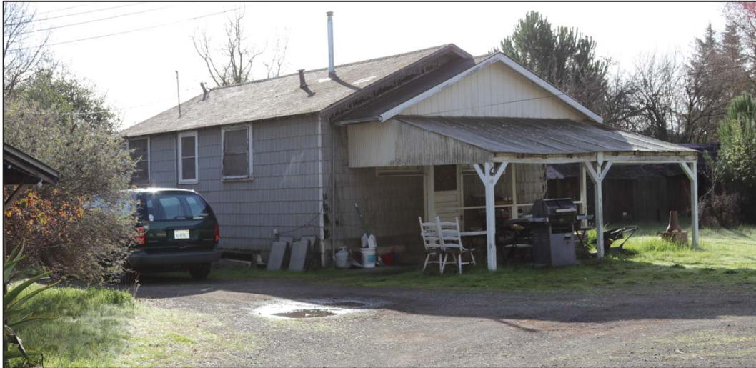
Figure 37: North and west elevations, northwest corner