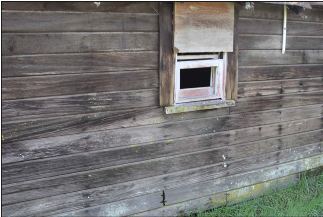
Figure 73: North elevation, window detail