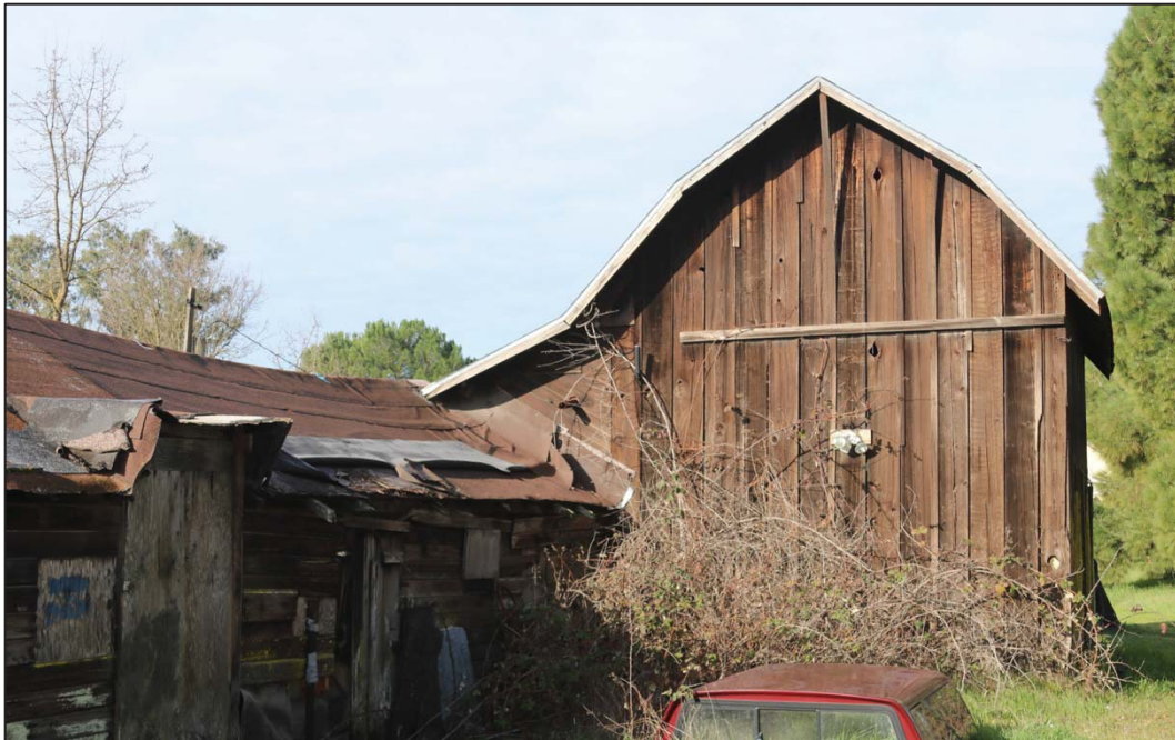
Figure 81: East elevation