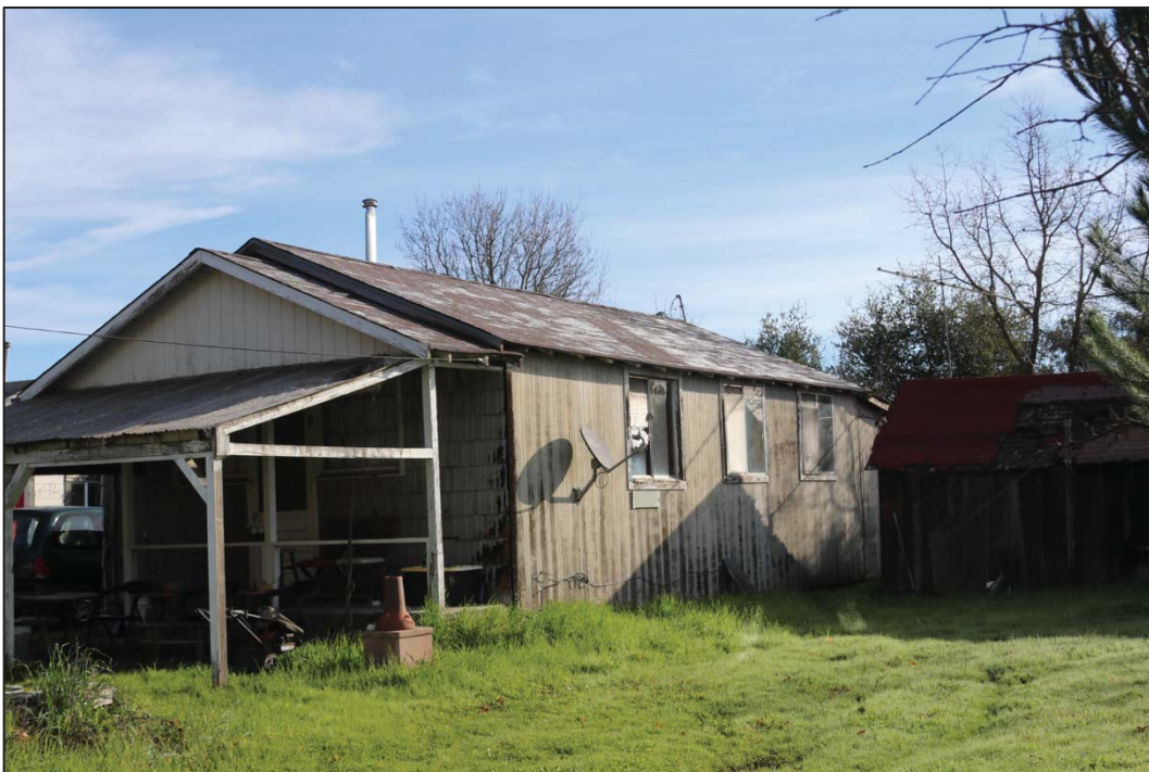
Figure 40: West and south elevations, southwest corner