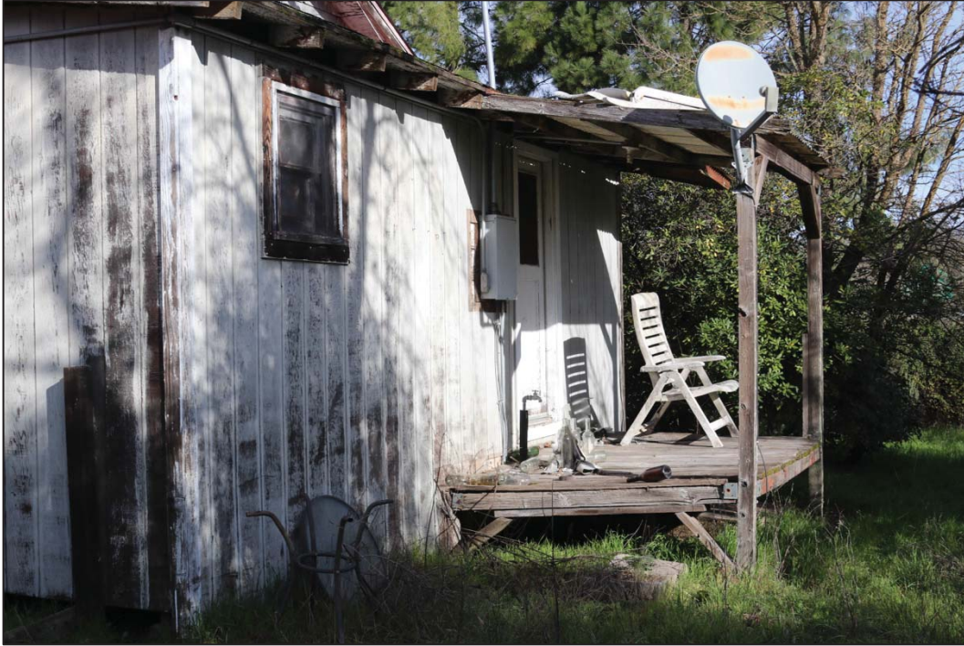
Figure 43: East addition, back porch