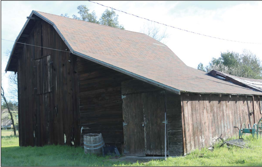
Figure 79: West and south elevations, gambrel section and shed wing