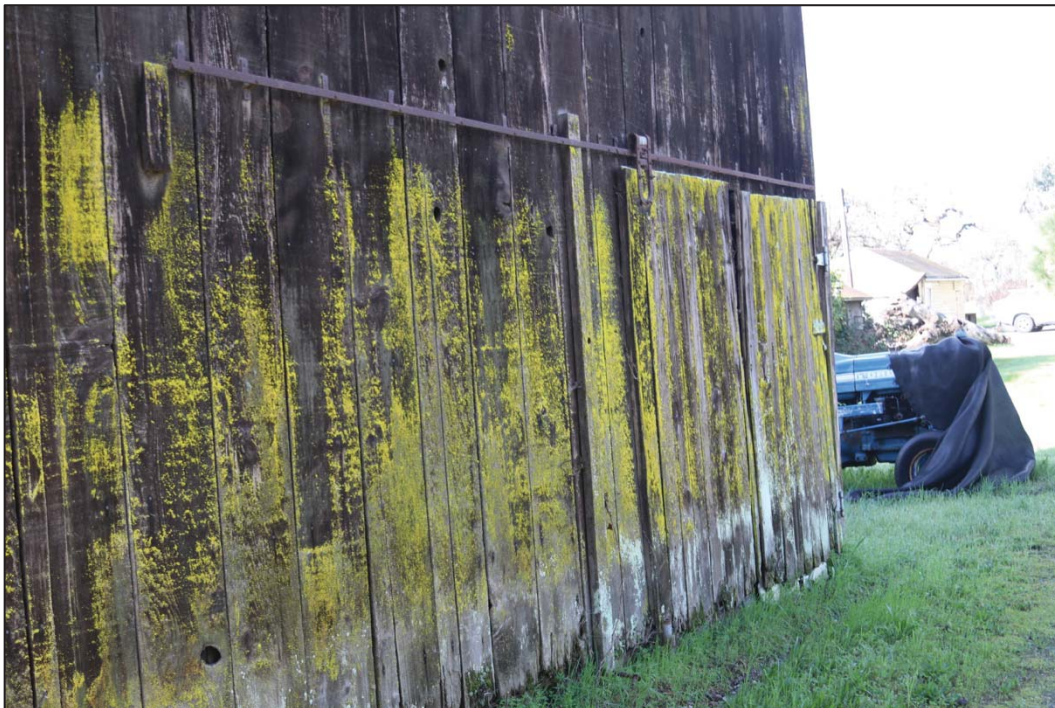
Figure 84: North elevation, sliding doors