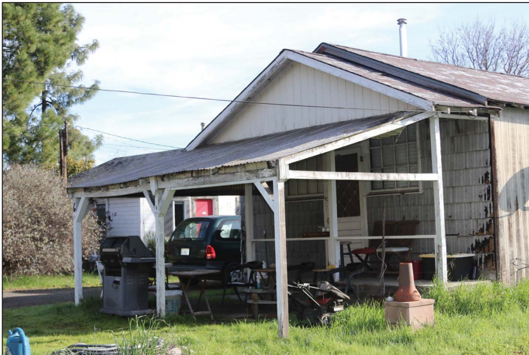
Figure 38: West elevation, porch (front)