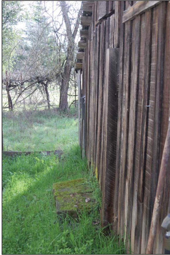
Figure 69: North elevation