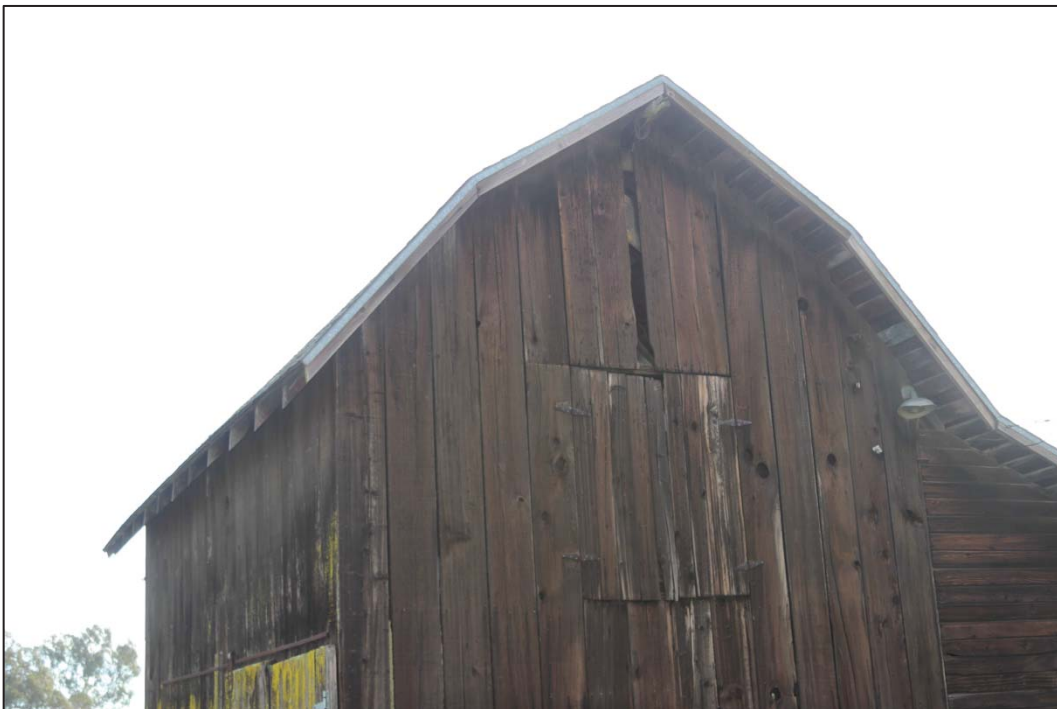
Figure 78: West elevation, gambrel peak, hay loft door