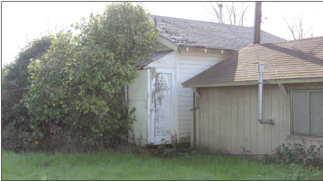
Figure 35: North elevation, rear wing (overgrown)