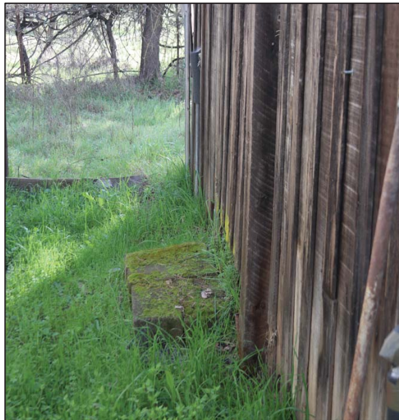
Figure 70: North elevation, stoop made of concrete blocks