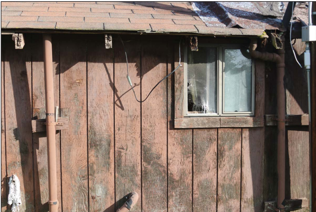
Figure 80: South elevation of shed wing, modern window and siding