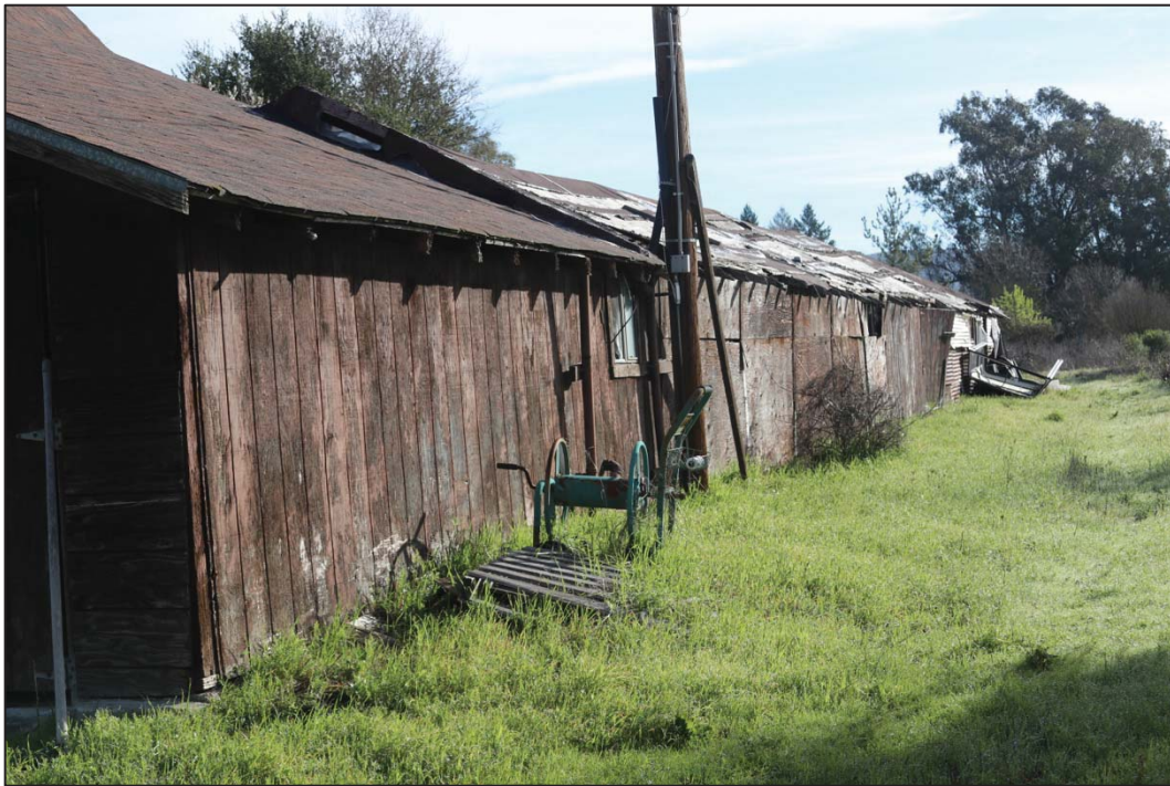
Figure 75: South elevation, looking east