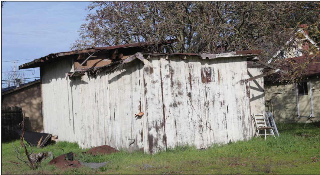
Figure 49: East and south elevations, southeast corner