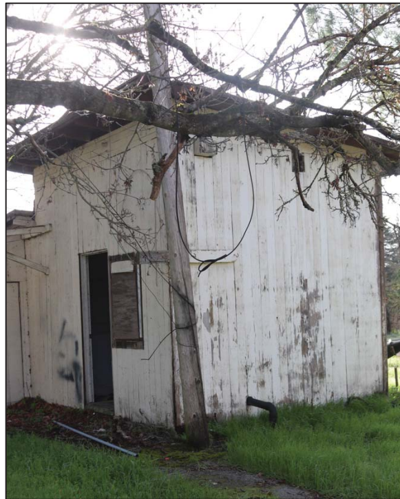
Figure 44: West and north elevations