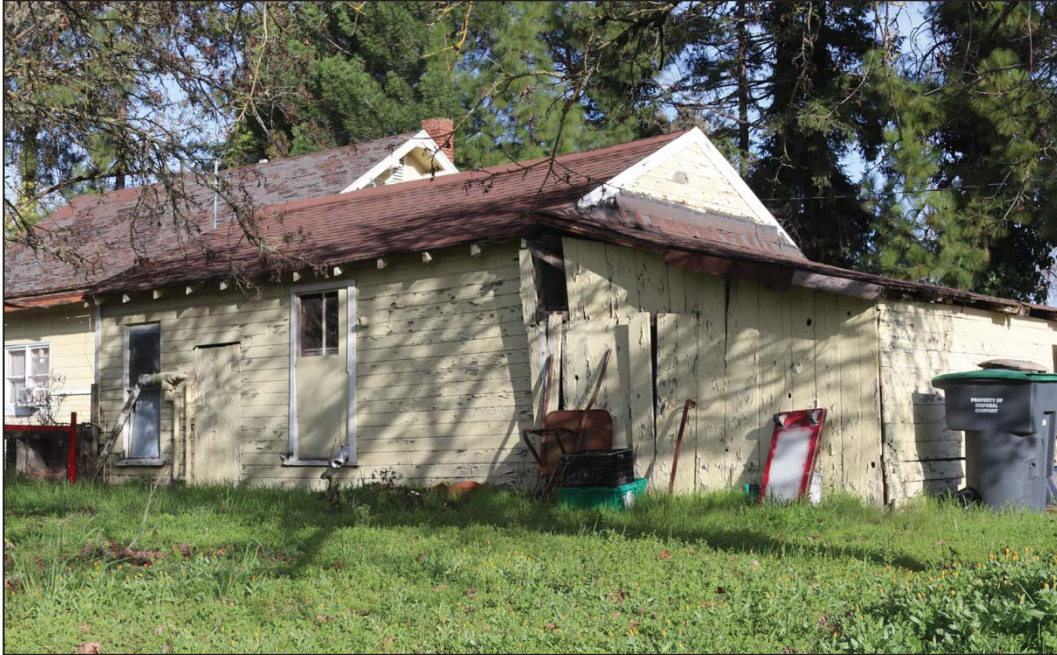
Figure 51: South elevation, shed addition on east