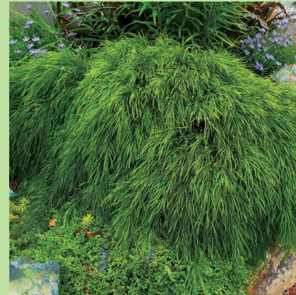
ACACIA COGNATA 'COUSIN ITT'