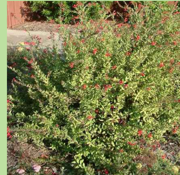
GALVEZIA S. 'FIRECRACKER'