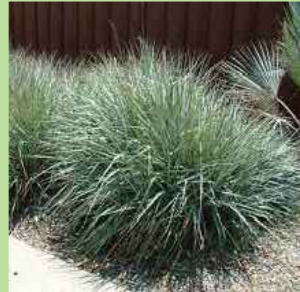
ELYMUS C. 'CANYON PRINCE'