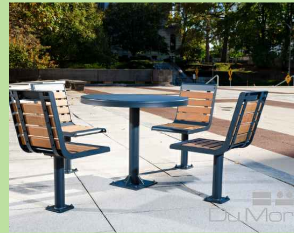
TABLE AND CHAIRS