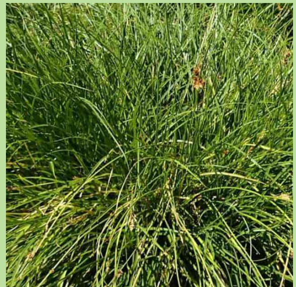
CAREX TUMULICOLA (DIVULSA)