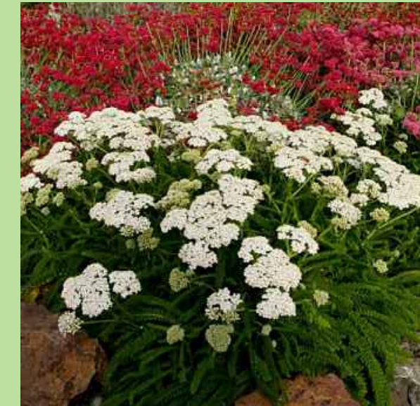
ACHILLEA M. 'SONOMA COAST'