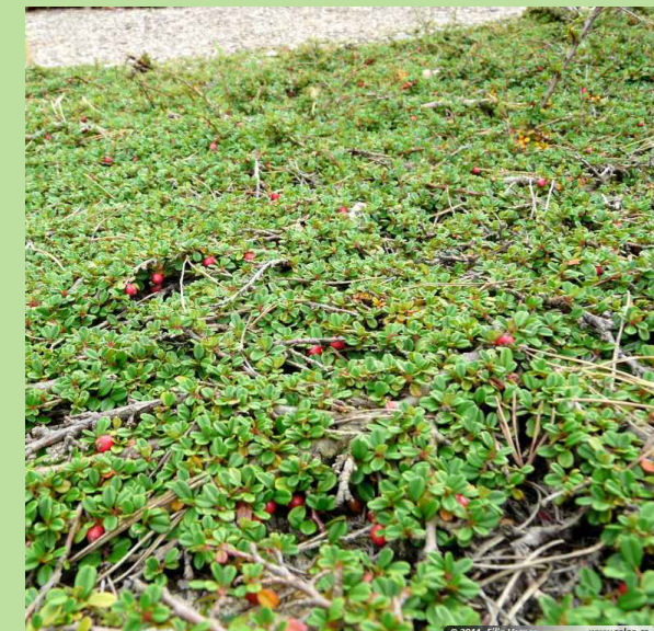
COTONEASTER D. 'LOWFAST'