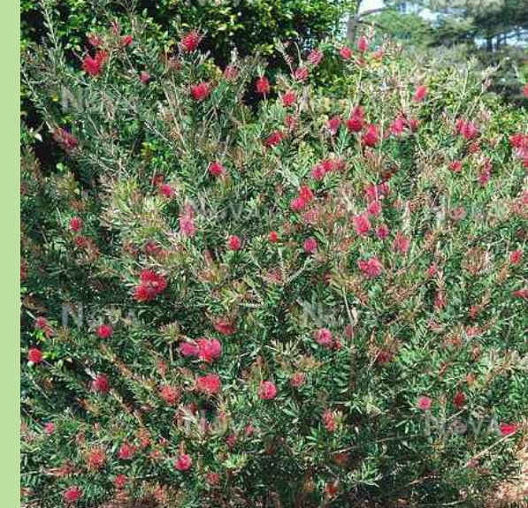
CALLISTEMON C. 'JEFFERSII'