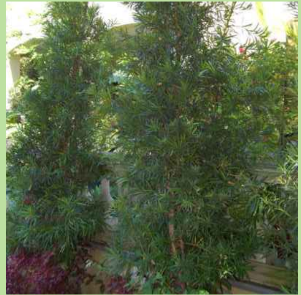
PODOCARPUS MACROPHYLLUS 'MAKI'