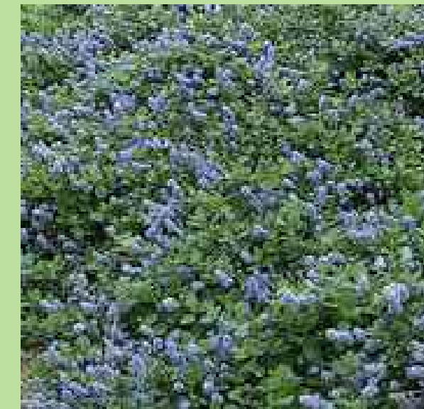
CEANOTHUS G. H. 'YANKEE POINT'