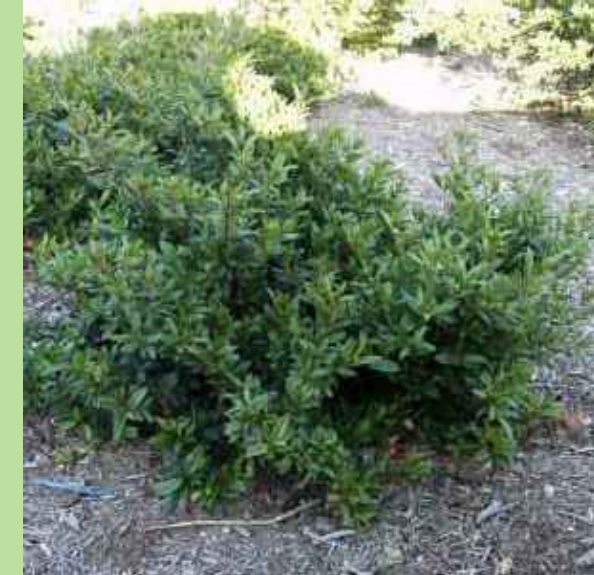
RHAMNUS C. 'MOUND SAN BRUNO'