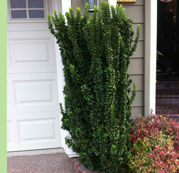
EUONYMUS JAPONICUS 'GREEN SPIRE'