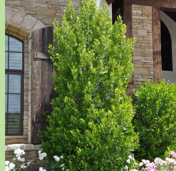
PRUNUS CAROLINIANA 'COMPACTA'