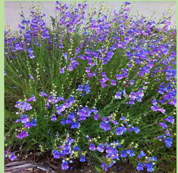
PENSTEMON H. 'MARGARITA BOP'