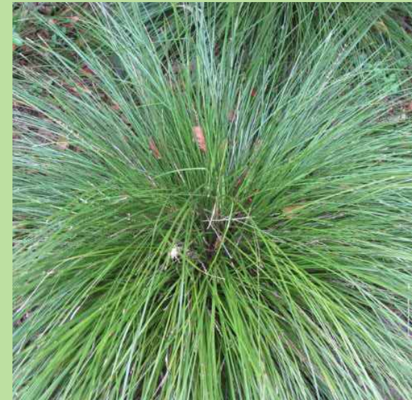
LOMANDRA L. 'BREEZE'