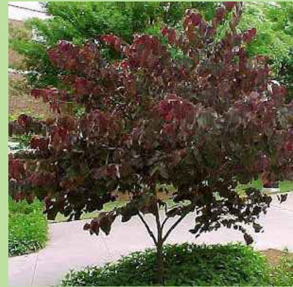
CERCIS CANADENSIS 'FOREST PANSY'