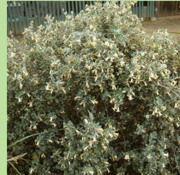
CORREA 'IVORY BELLS'