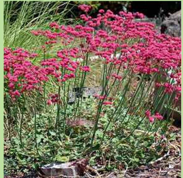
ERIOGONUM GRANDE RUBESCENS