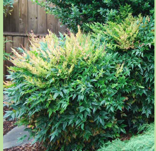
NANDINA D. 'GULF STREAM'