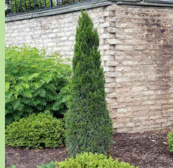
JUNIPERUS C. 'SPARTAN'