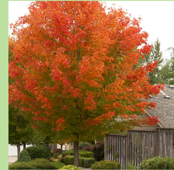
ACER RUBRUM 'OCTOBER GLORY'