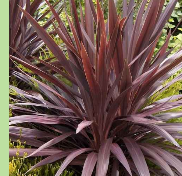
CORDYLINAE AUSTRALIS 'RED STAR'