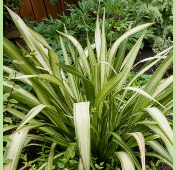
PHORMIUM 'YELLOW WAVE'