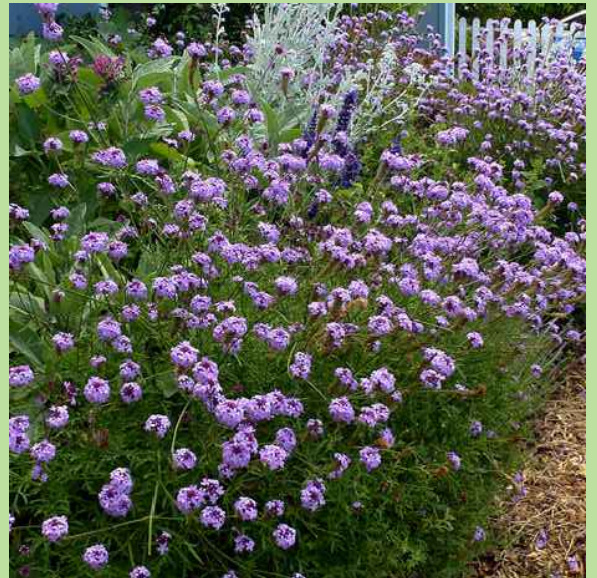
VERBENA LILACINA 'DE LA MINA'