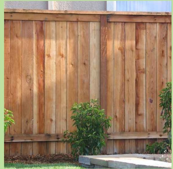
WOOD GOOD NEIGHBOR FENCE