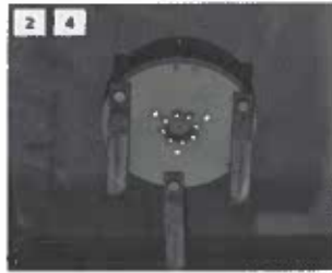
4. CIRCULAR FLYWHEEL WITH 3 UPDRAFT BLADES BOUNCES OFF STUMPS