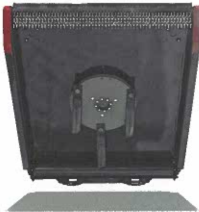
DETAIL UNDER DECK