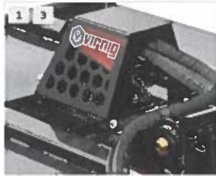
1. DIRECT DRIVE EATON® MOTOR WITH RELIEF VALVES