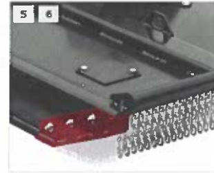
5. CHAIN CURTAIN PREVENTS FLYING DEBRIS