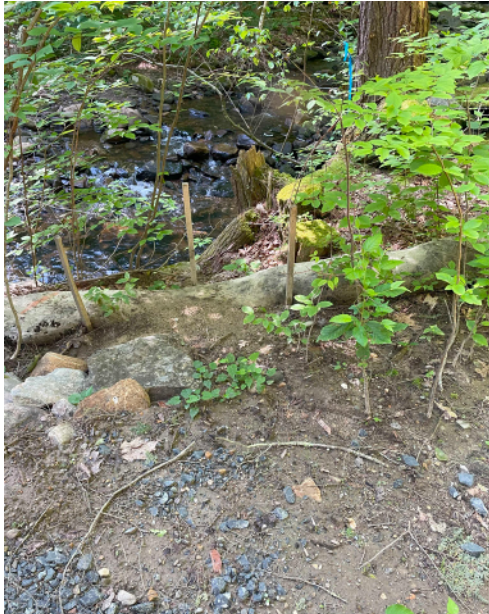
Erosion by abutment (6.2025)