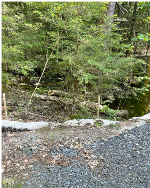
Erosion by abutment (6.2025)