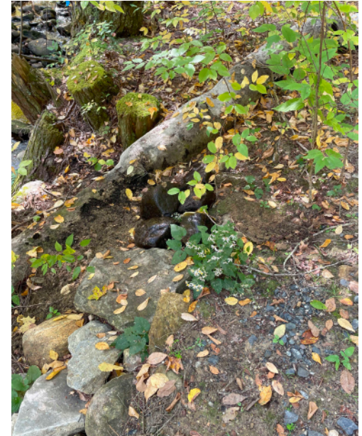
Rock reinforcement to prevent erosion. Left: larger context. Right: detail. (9.2025)