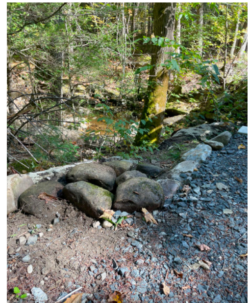
Rock reinforcement to prevent erosion. Left: larger context. Right: detail. (9.2025)