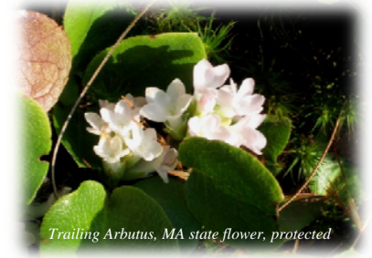
Trailing Arbutus, MA state flower, protected

Many species of wildlife call the Fiske Pond Conservation Area home including moose, deer, beaver, spotted turtle, kingfisher, and great blue heron.