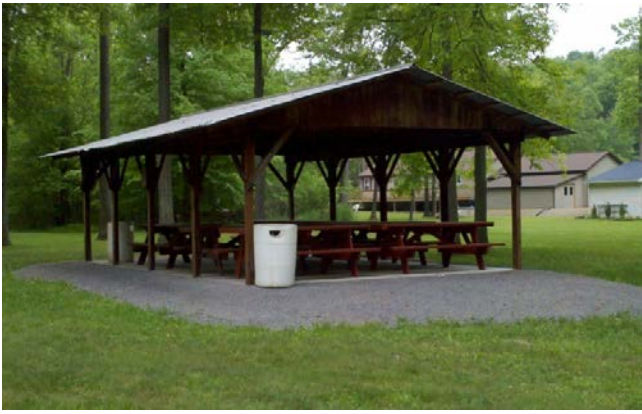
Shelter 1-near restrooms