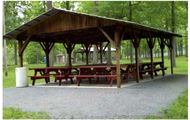
Shelter 2-near woods