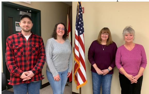
PHOTO: Councilor Klym, Councilor Pederson, Councilor Hernandez, and Mayor Skyberg were sworn in Tuesday, January 10, 2023.

City Council passed Resolution 22-23-009, Authorizing support of the Oregon Mayors Association’s Taskforce on Homelessness’s Proposal.