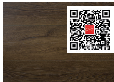
Night Owl PRO3306