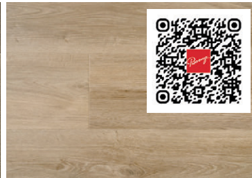
Grand Tour PRO3310