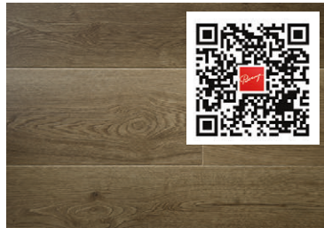
Timber Wolf PRO3309