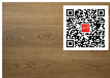
Nest Egg PRO3305