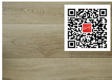
Daring Doe PRO3301