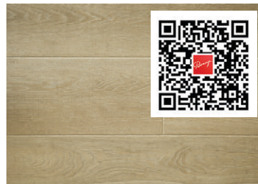
Great Escape PRO3302