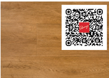
Pitch Perfect PRO3312