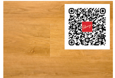
Love Birds PRO3311