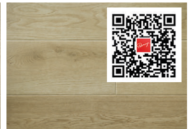
Lunar Glow PRO3303