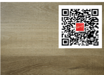
Modern Mink PRO3304