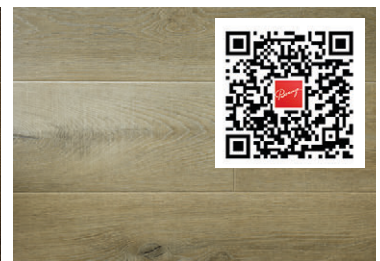
Playful Pony PRO3307