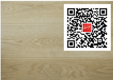
Rare Earth PRO3308