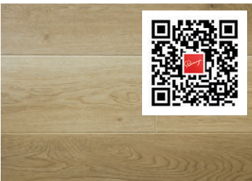
Bashful Beige PRO3300