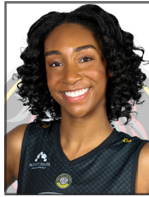
MB - Hord