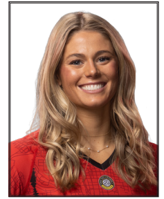
S - Stringer