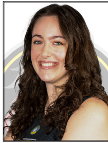
Opp - Drechsel