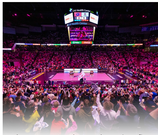
The Supernovas beat Atlanta in a five-set thriller in front of a U.S. Pro Volleyball record 13,486 fans on January 10, 2025, at the CHI Health Center.