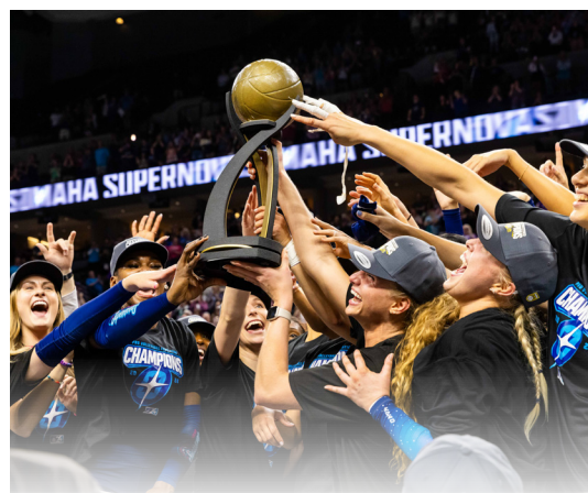
The Supernovas swept Grand Rapids to claim the inaugural MLV Championship on May 18, 2024, at the CHI Health Center in Omaha.