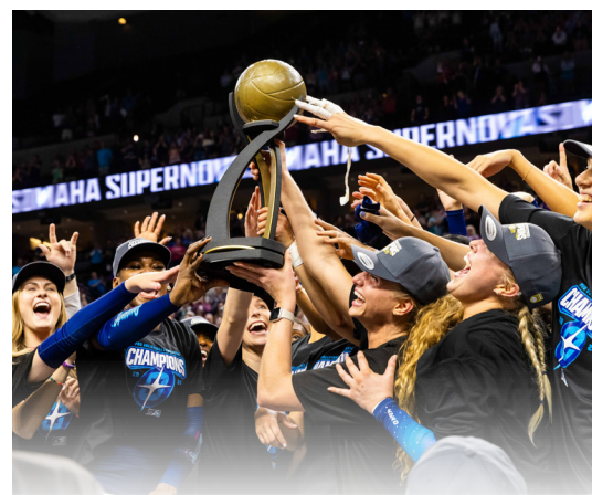
The Supernovas swept Grand Rapids to claim the inaugural MLV Championship on May 18, 2024, at the CHI Health Center in Omaha.