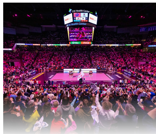
The Supernovas beat Atlanta in a five-set thriller in front of a U.S. Pro Volleyball record 13,486 fans on January 10, 2025, at the CHI Health Center.