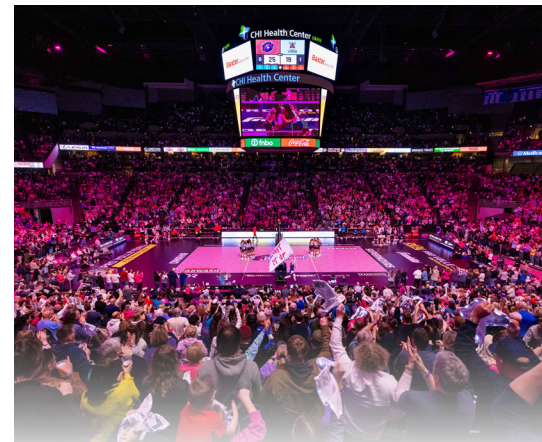
The Supernovas beat Atlanta in a five-set thriller in front of a U.S. Pro Volleyball record 13,486 fans on January 10, 2025, at the CHI Health Center.