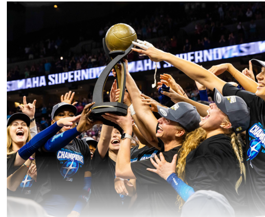
The Supernovas swept Grand Rapids to claim the inaugural MLV Championship on May 18, 2024, at the CHI Health Center in Omaha.