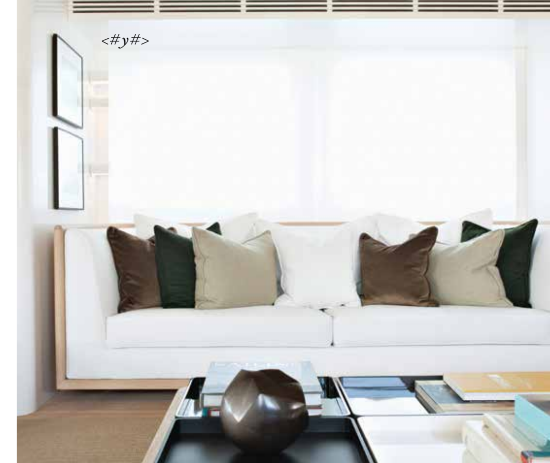
<#y#> Left: the two-and-a-half-year rebuild at Rybovich in Florida changed many features on the 2003-built yacht, including the indoor dining area on the main deck. An informal dinette has been introduced, lit by highly distinctive large glass lanterns, manufactured by Lebanese firm PSLab. Above: the main saloon aft of the dinette. Below: the outdoor lounge on the upper deck

"If you had been in our home and walked on to our boat, you'd say they felt the same"