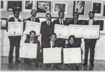
Presentation of the honor certificates from photo club KBC of South Vietnam in 1973 to PSNY Members.