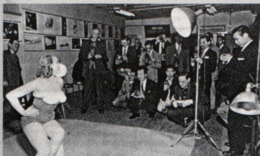
PSNY Model Session in the PSNY studio in 1969. 一九六九年本會舉辦公開式之攝影活動。