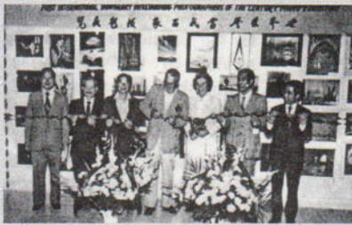
First Hon OPC - PSNY Exhibition Grand Opening.