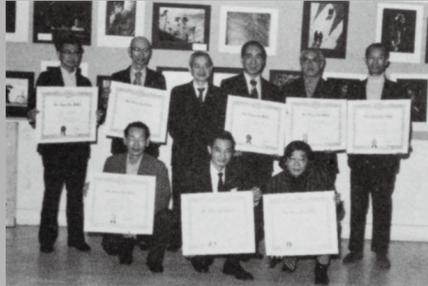
Presentation of Certificates of Honor to PSNY members by the Photo Club of KBC South Vietnam, 1973.

一九七三年本會主辦首屆國際彩色照片展覽，由電影明星嚴俊、虞慧小姐及會長甄啟棠主持開幕典禮。