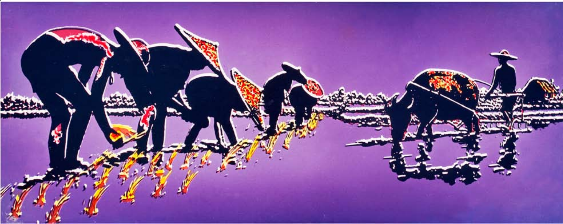
Rice Planting 插禾 (1966) Lee, Wellington 梁光明 / USA 美國