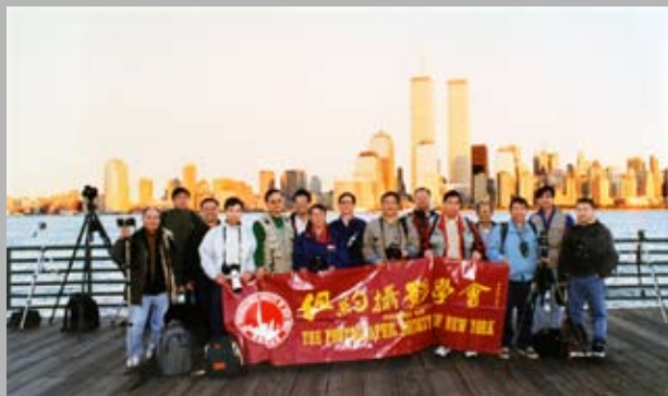
PSNY field trip, photographing NYC's Twin Towers at Liberty State Park, New Jersey.