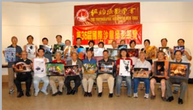
36 th PSNY Salon Exhibition, 2008