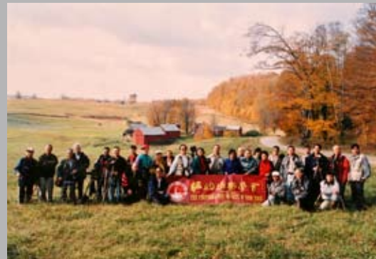
Club Members at Jenny Farm, Vermont