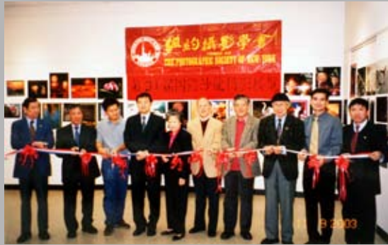
31 st PSNY Salon Exhibition, 2003