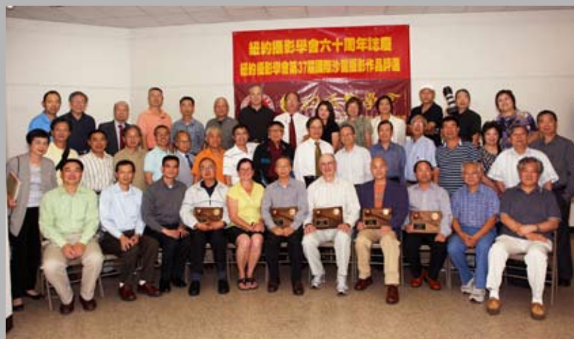
37 th PSNY Salon Exhibition, 2009