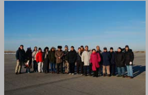
Field Trip at Fire Island, Long Island NY, 2005.