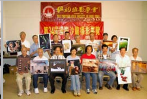
34 th PSNY Salon Exhibition, 2006