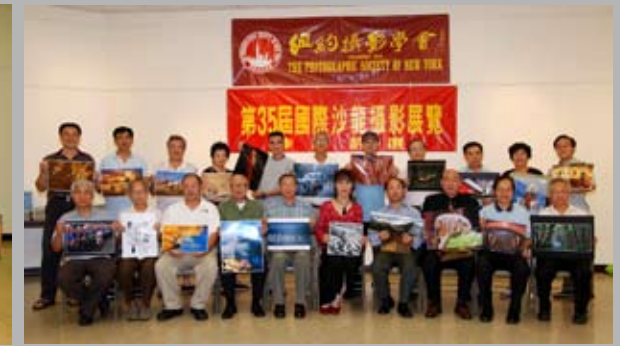
35 th PSNY Salon Exhibition, 2007