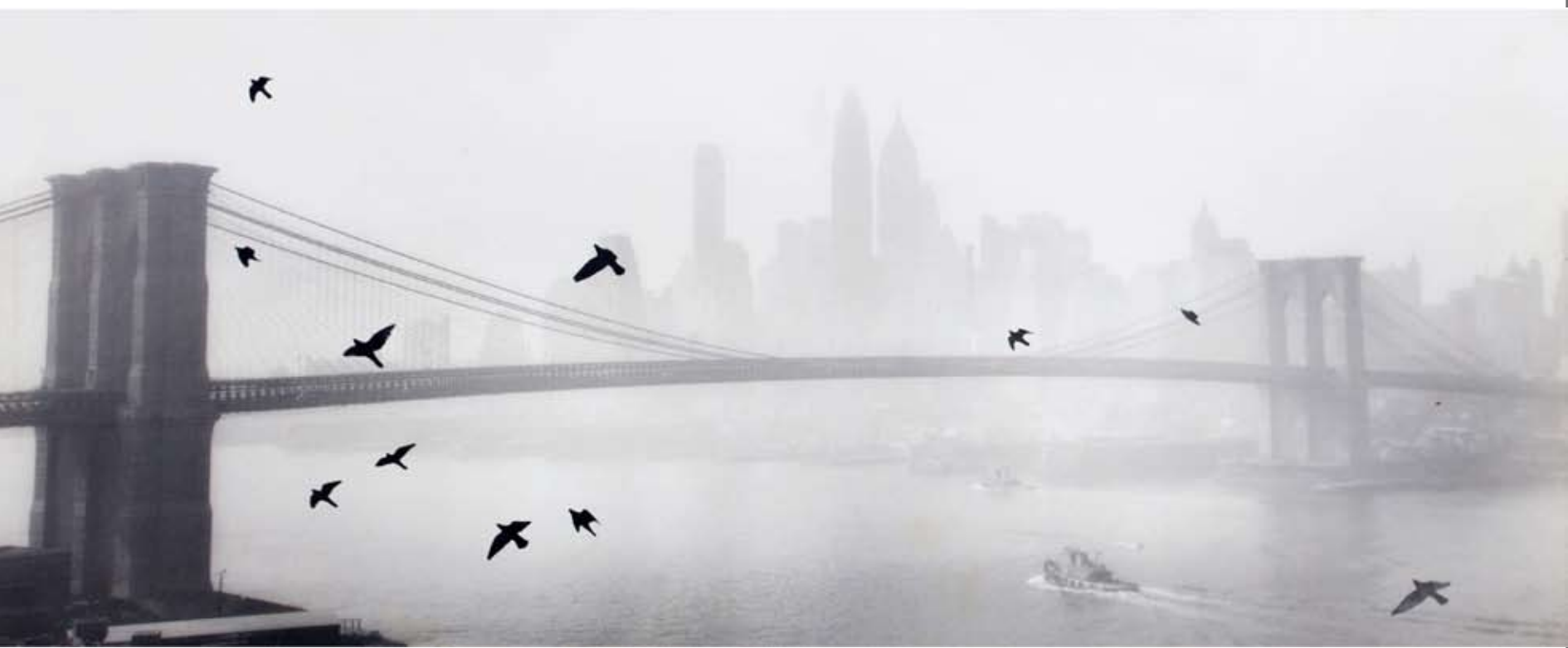
Misty New York(1959)