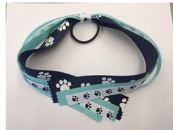
Pony Tail Ribbons $10