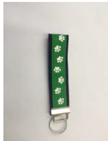
Key Fobs $5