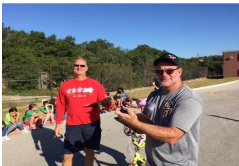
Volunteers make Bike Rodeo possible

Trophies were awarded to 1st, 2nd, and 3rd place girl and boy winners of each grade level. The top scoring students will receive an official invitation to the city-wide Bike Rodeo in the Spring.