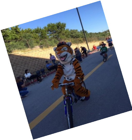
Tusky gives his biking skills a try!