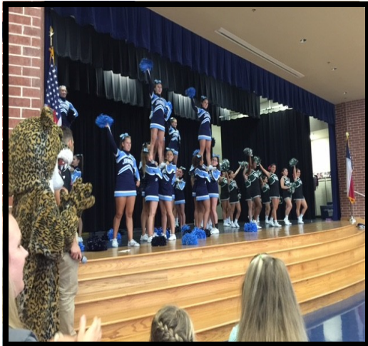
Reagan and Johnson High School Cheerleaders get Tuscany Heights families excited for the new school year!

We kicked off a new year at Tuscany Heights by getting our Tigers fired up with a Leadership Pep Rally to educate families about the Leader in Me program as well as Watch D.O.G.S.