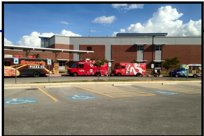
Families enjoyed food truck service from local restaurants.