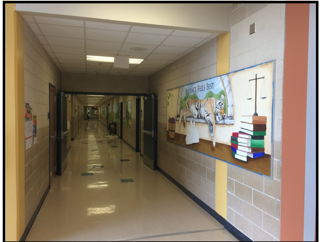
The "Balance Feels Best" mural by Halie Koehler that covers the wall near the gyms.