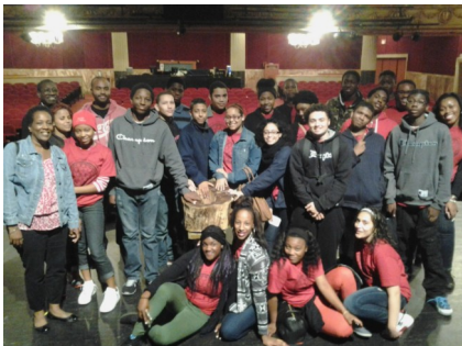
A trip to the Apollo Theater in NYC, 2014.

Manage Your Future (MYF) is a career exploration and planning program for youth ages 14—18. The program is designed to provide participants with the means to explore an extensive variety of career opportunities that can lead to career planning, goal-setting, and a pathway to prosperity. The program provides participants with an understanding of expectations in the workplace related to behavior, attitudes, attire, accountability, and responsibility. Incorporated into the program are lessons to enhance financial literacy, soft skills, job interviewing techniques and performance. Educational and cultural trips are provided. The program strives to produce responsible, well-adjusted, and connected young adults