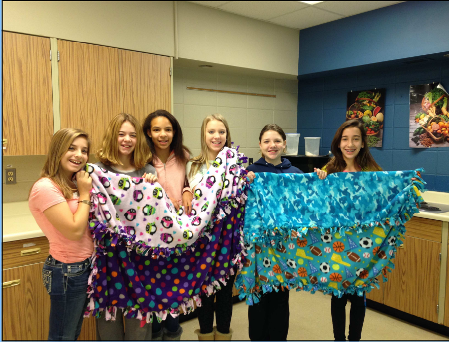
Project Warm-Up Blankets Made by Students