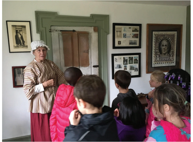
Third grade field trip to Nathan Hale House