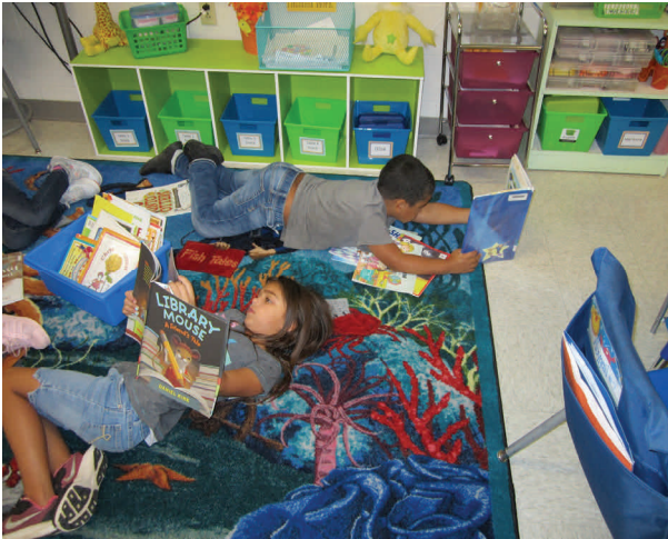
Grade 2 Reading