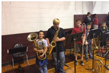
LBJMS Band members provided the music at the first Pep Rally