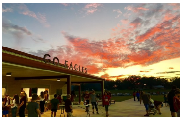
Sunset view from Eagle Field at the September 14th Middle School games