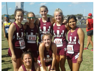
LBJHS Varsity Girls Regional Qualifiers