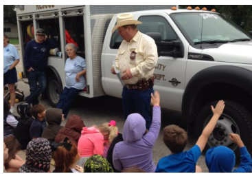
Members of our JCVFD taught LBJE students about personal and fire safety during National Safety Week