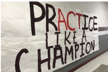
LBJHS Cheerleaders promote school spirit with signs throughout the campus