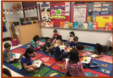
LBJE students reading independently during The Daily Five