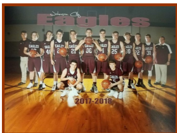
Eagle Varsity Basketball—Champions in the LBJHS Invitational