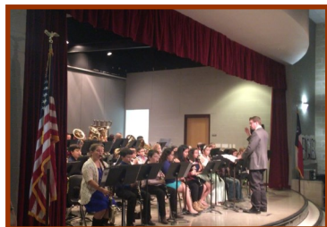
The LBJ Middle School Band performs in the Winter Holiday Concert