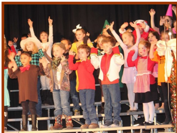
1st Grade students performing "Toys—The Night They Came Alive"