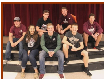
2018 THSCA Football Academic All-State members