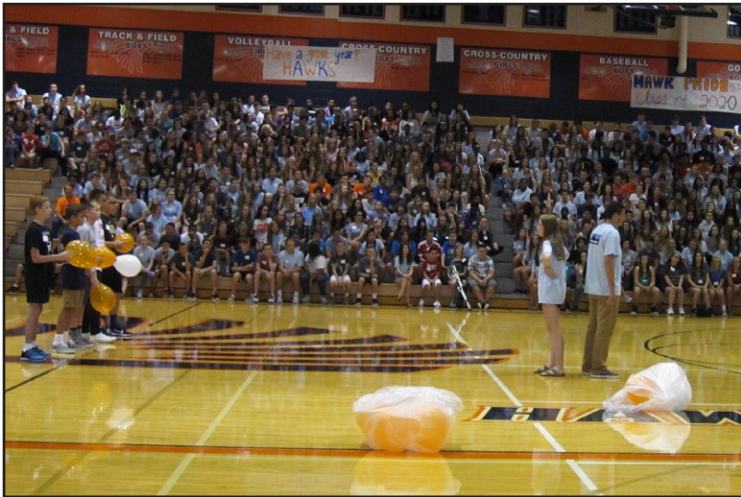
Freshmen cheer on their classmates as they get ready to compete with Hawk Leaders in the Balloon Pop Relay