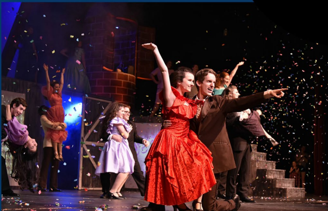
2015 Fall Mainstage Musical: Footloose

For Tickets: Visit www.oetheatre.com or Call 913-780-7889