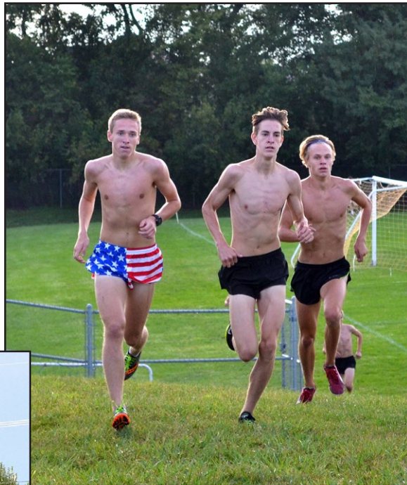
(left) Cross Country runners participate in the annual Donut Run. (below) After the Donut Run, participants chow down on some glazed donuts. (bottom) Olathe East Volleyball players go up for a block.