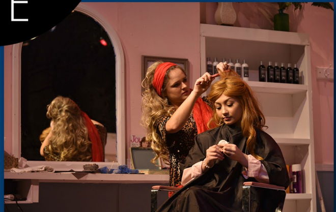
2016 Spring Mainstage Play: Steel Magnolias