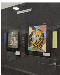
The Knight and the Panther

One standout project from the Creative Exchange involves a partnership between Creative Writing students and AP and Honors Art students. Students compose original short stories that are then visually interpreted through companion artworks, resulting in a rich, cross-curricular display of storytelling and visual creativity.