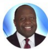
Kenny Crumpton Emcee "Kickin It W/ Kenny" FOX 8 News