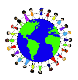
Visit our webpage <a href="https://www.mccsc.edu/university">https://www.mccsc.edu/university</a>