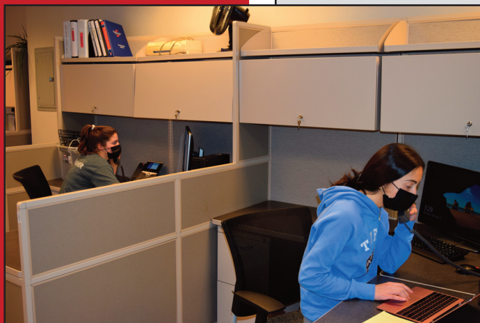
RHS students manning the vaccine helpline