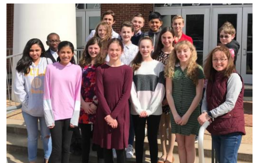
PBIS Students of the Month – Showing Respect to Adults