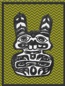
By: Art Manginelli