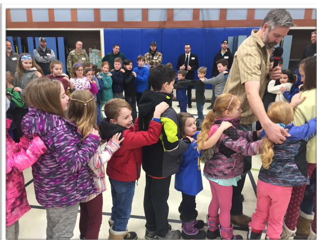
Chugiak Elementary School

http://allprodadchapters.com/chapters/12004