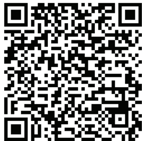
Block Rotation Calendar