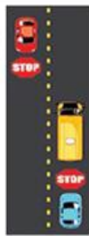
TWO LANE Both directions MUST STOP