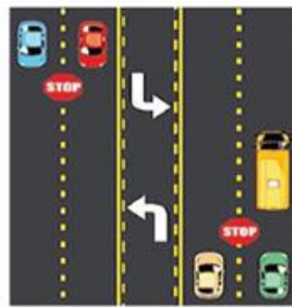
MULTI-LANE, SHARED MEDIAN Vehicles traveling in both directions MUST STOP