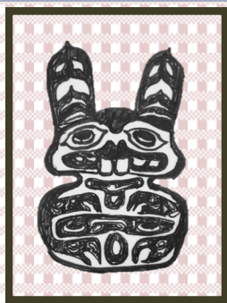
By: Art Manginelli