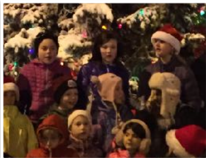
The Chugiak Elementary Choir performed beautifully at the Eagle River Tree Lighting

Finally, if you prefer the old fashioned ways of stopping in person or writing me a note, I look forward to hearing from you! Your input is valued and always welcome. Our overall program and student experience are strengthened through your involvement and sharing your voice!