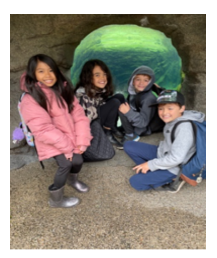
Our 2<sup>nd</sup> graders, who have explored animals and will work on building a butterfly habitat this spring, went to the zoo on a field trip this week. Animals and habitats have been woven throughout their work this year!

These are just a few of the projects classrooms have worked on this year. Much of this is made possible by our generous School Enrichment Committee (SEC) funds. We are