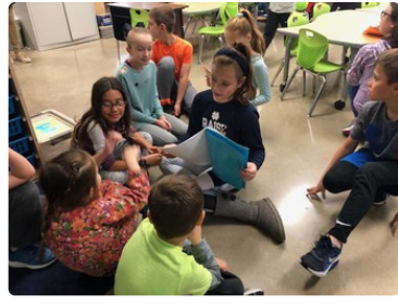
4th Grade Writers Sharing with Kindergarten