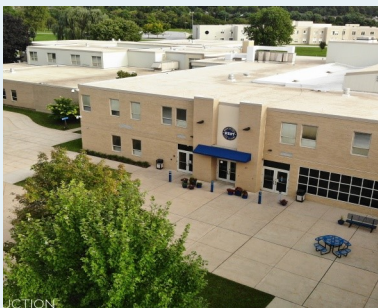
Aerial View of Downingtown West High School

Click the DASD logo to view a copy of the 2021-2022 Board Approved District Calendar.