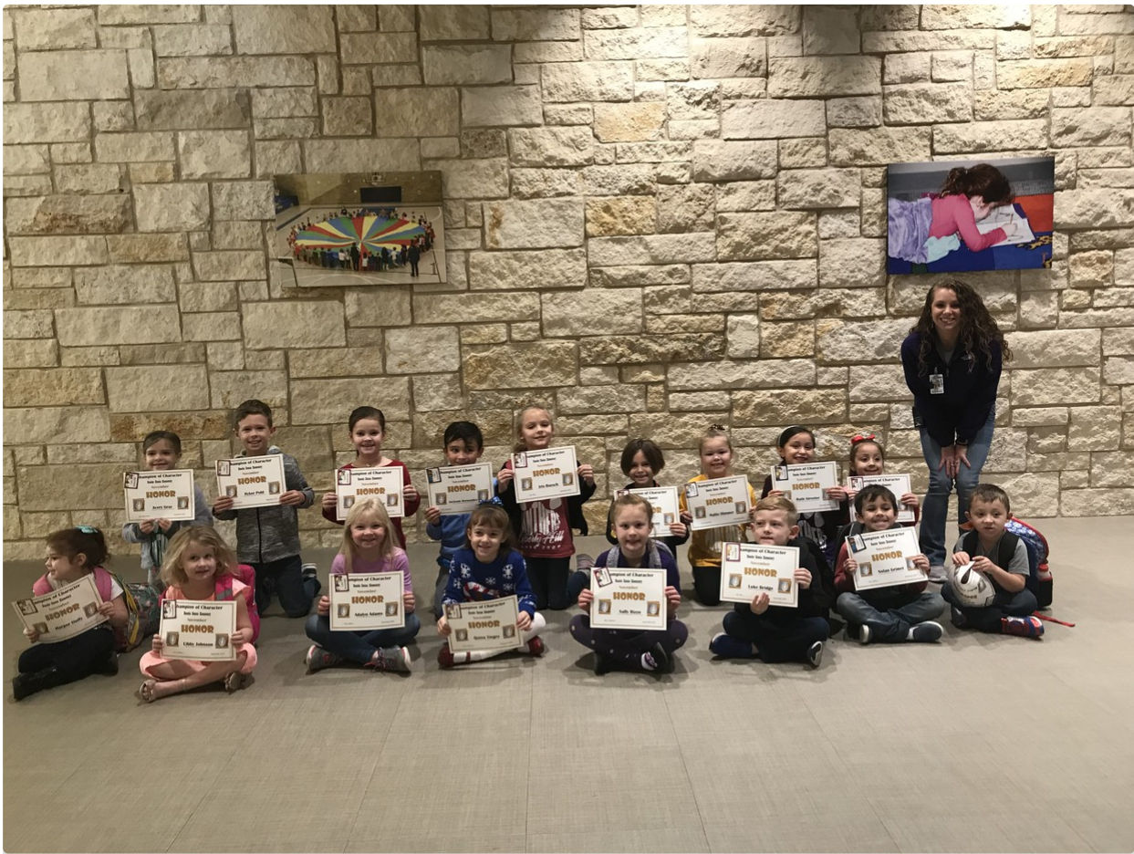
Texas Community Challenge #LHStrong