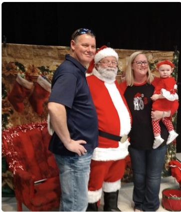
Santa Visits RSE families