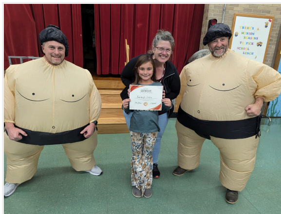
PRIDE Award from Specials teachers!