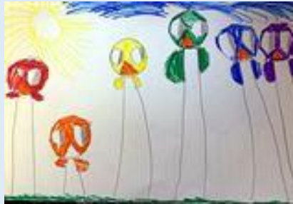
Valerie Arenas, Kindergarten