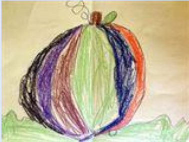
Jack Cruz, Kindergarten