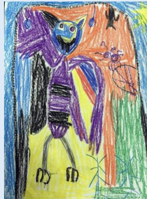
Atticus Murdoch, 2 nd Grade, Beautiful Opps!