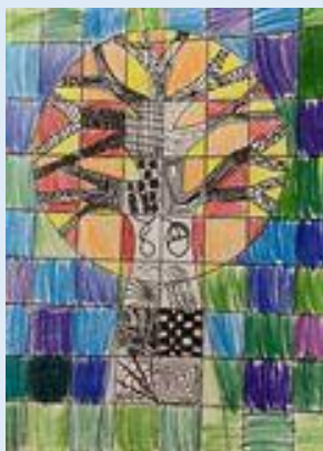
Addison Geiss, 3 rd Grade, Warm/Cool Zentangle Tree