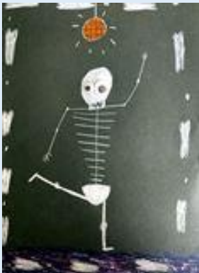
Emily Townsend, 2 nd Grade, Skeleton