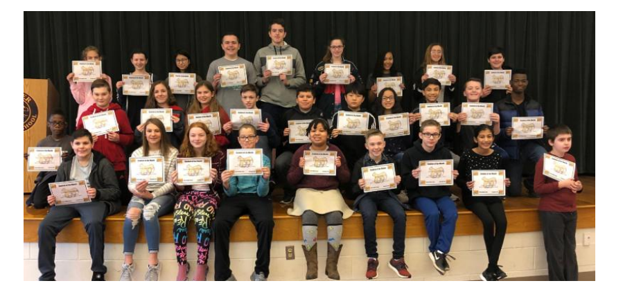
Together – we prepare our students for their future.