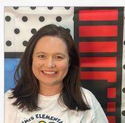
Dean of Students