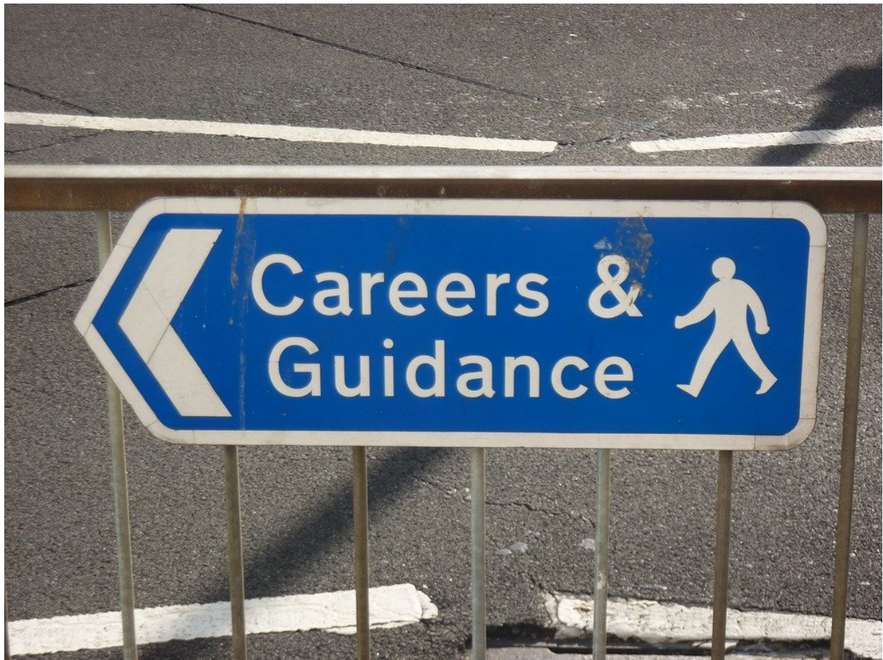
Guidance Google Classroom

"We are Early College, being the best we can be."