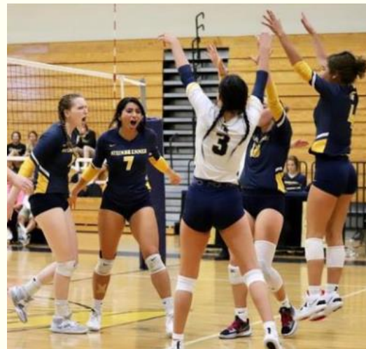
Steinbrenner Lady Warriors Volleyball

PTSA Calendar Steinbrenner Calendar District Calendar